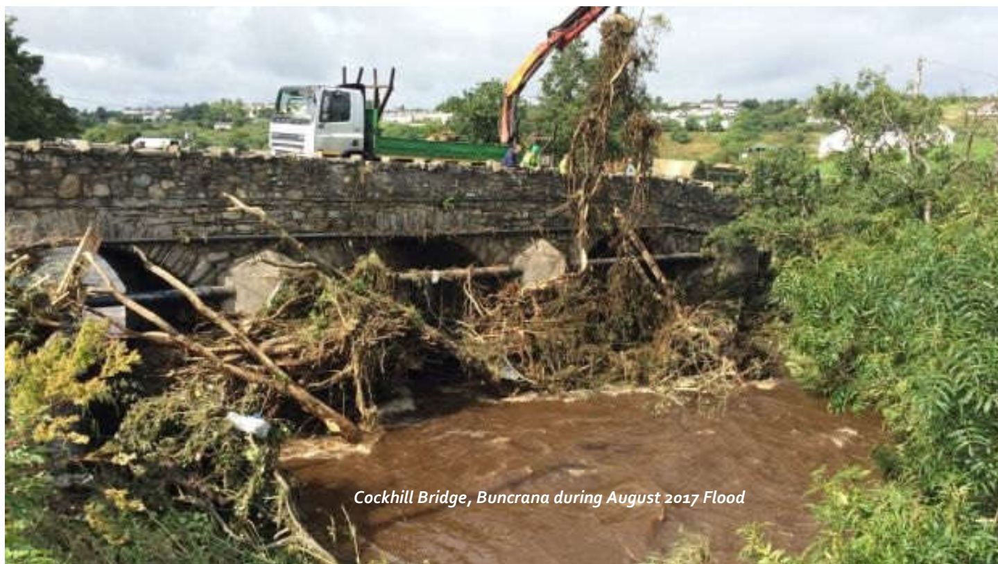
Cockhill Bridge, Buncrana during August 2017 Flood

Donegal County Council commissioned ByrneLooby in May 2021, to develop and implement a Flood Relief Scheme for Buncrana.