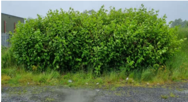
Invasive Species – Japanese Knotweed surveyed in Cavan Town

Envirico were appointed in March 2023 to conduct IAS survey and treatment for a 3-year period. Survey started in April 2023 on site and the first round of treatment for 2023 was completed in the first week of June 2023.