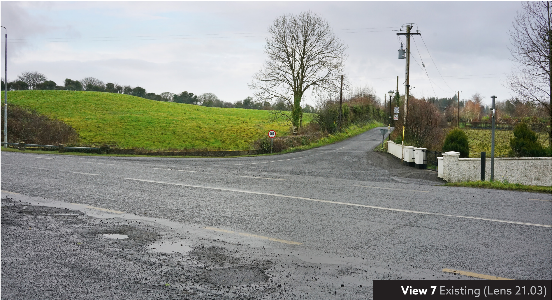
View 7 Existing (Lens 21.03)