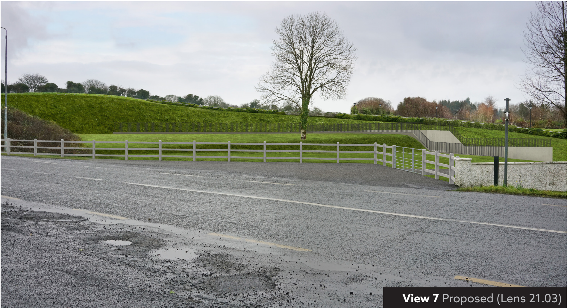
View 7 Proposed (Lens 21.03)