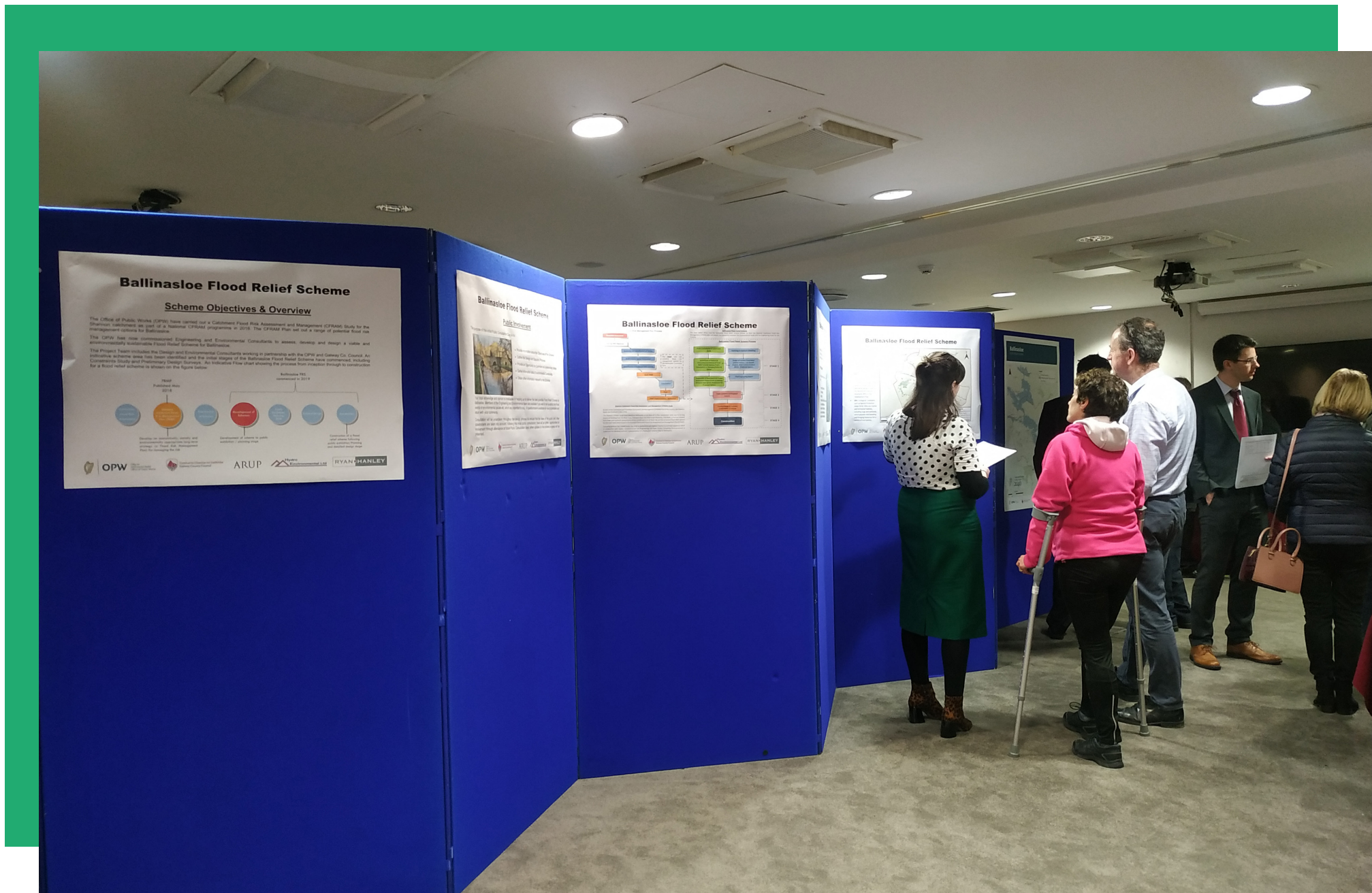
Image from Public Consultation Day No 1