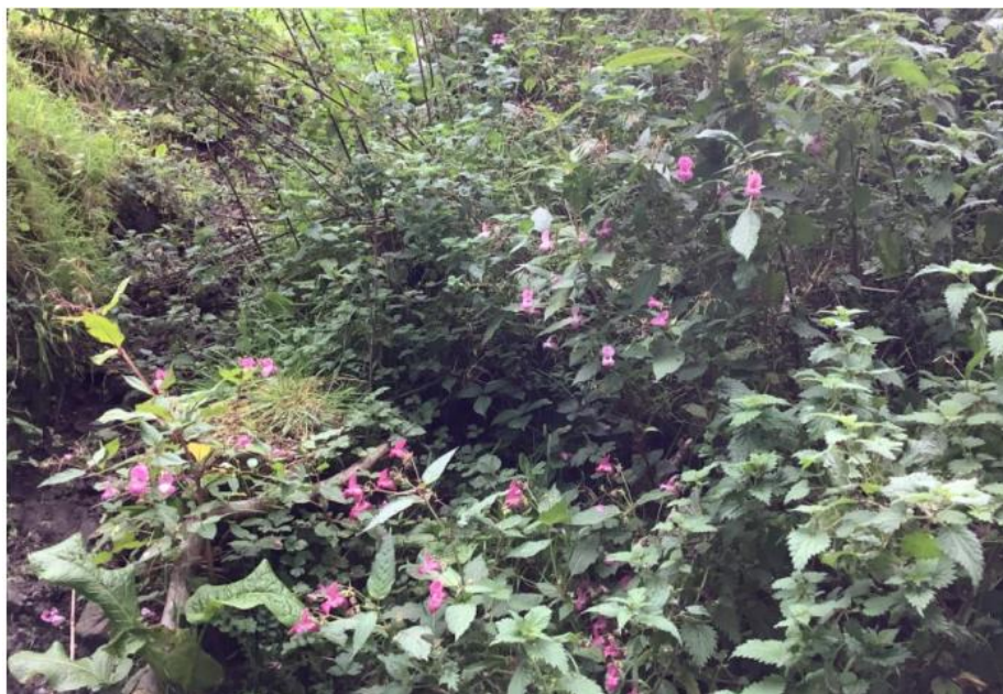
Himalayan Balsam upstream of Ramelton Community Centre 2021

An Invasive species survey was conducted by Ayesa Ecologists mid-June 2024 to assess the progress of previous IAS treatment. The majority of treated areas in Ramelton have reduced in size, but some areas still contain Himalayan Balsam and Japanese Knotweed growth. IAS Treatment contractors were on-site hand-pulling Balsam and treating Knotweed during July and October. A site walkover of areas and further treatment will be conducted next year.