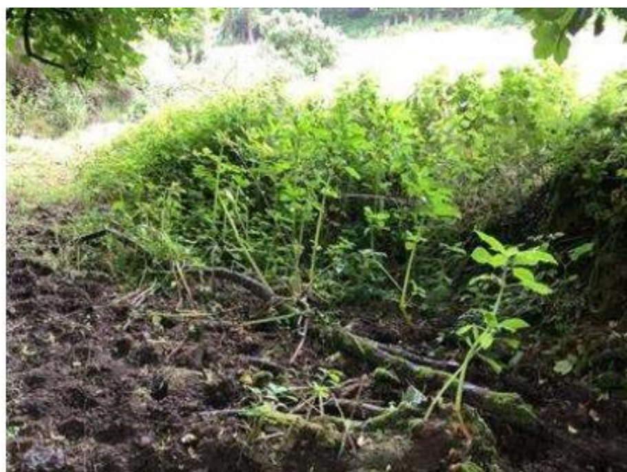
Himalayan Balsam upstream of Ramelton Community Centre 2024