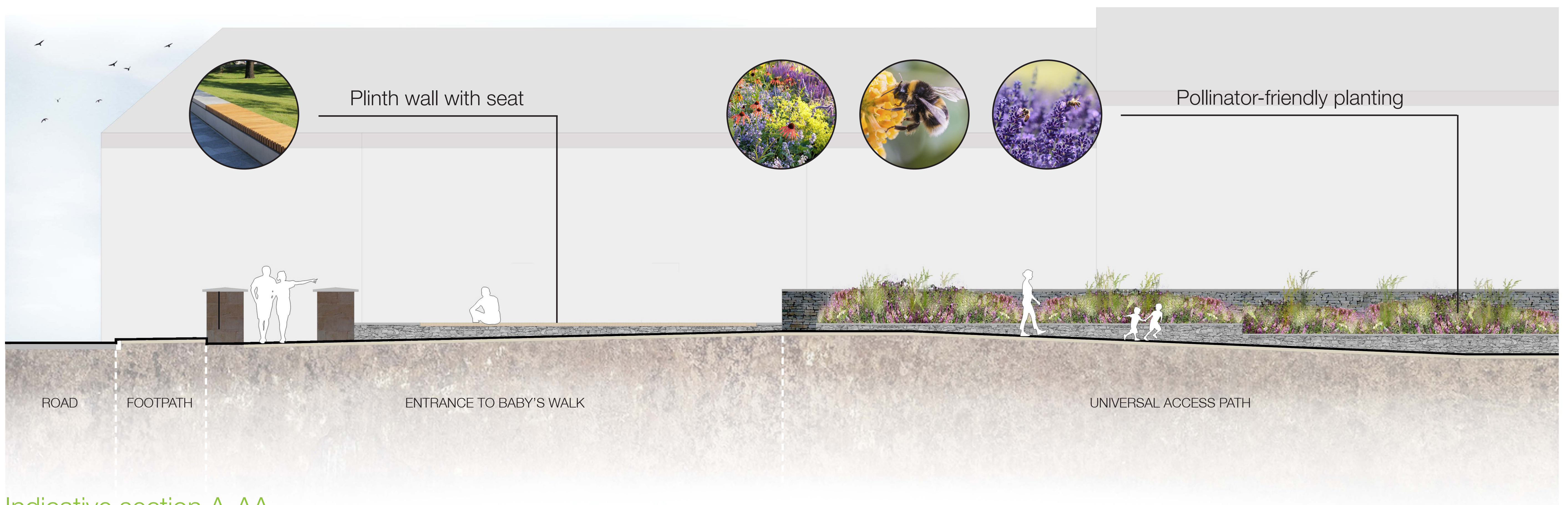
Indicative section A-AA