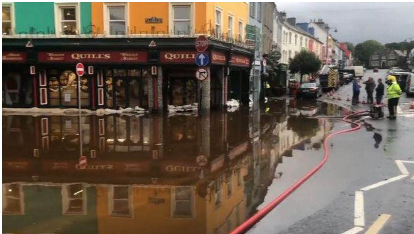
Flooding at Quill's Corner, Kenmare July 2020

The design standard of protection for the scheme is the 1% AEP fluvial event (1 in 100 year) and 0.5% AEP tidal event (1 in 200 year). The design will consider and allow for the impacts of climate change which may be realised over time.