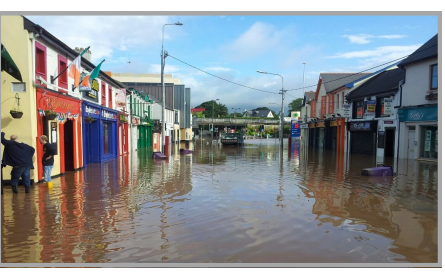
(Flooding in Douglas June 2012)