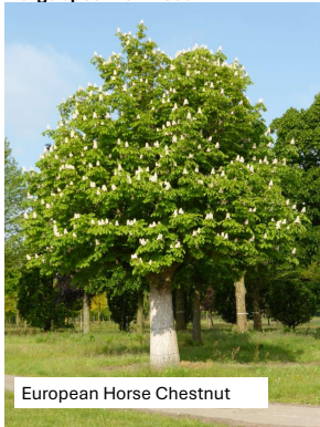
Large specimen trees