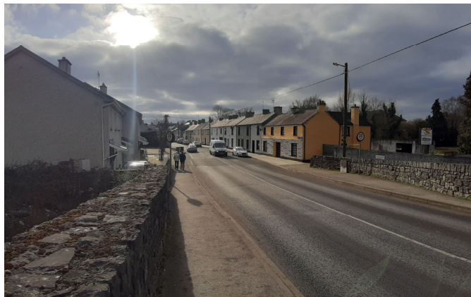
Figure 1— A view from the north (Spa St) into Portarlinton.

The Project Team consists of the Binnies/NOD joint venture, Laois Co. Co., the OPW, and Offaly Co. Co..