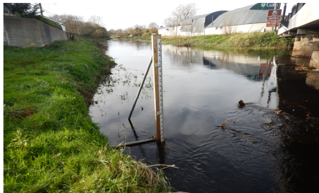
Figure 3 — River Barrow at Portarlinton Gauging Station.

The virtual public engagement event is a chance to meet the team and hear more about the project. See the other side of the brochure to find out details and other ways that you can get involved.