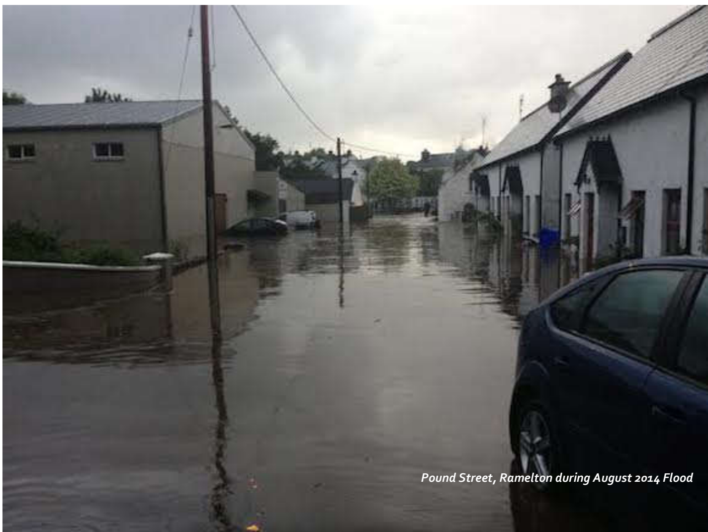
Pound Street, Ramelton during August 2014 Flood

Donegal County Council commissioned ByrneLooby in May 2021, to develop and implement a Flood Relief Scheme for Ramelton.