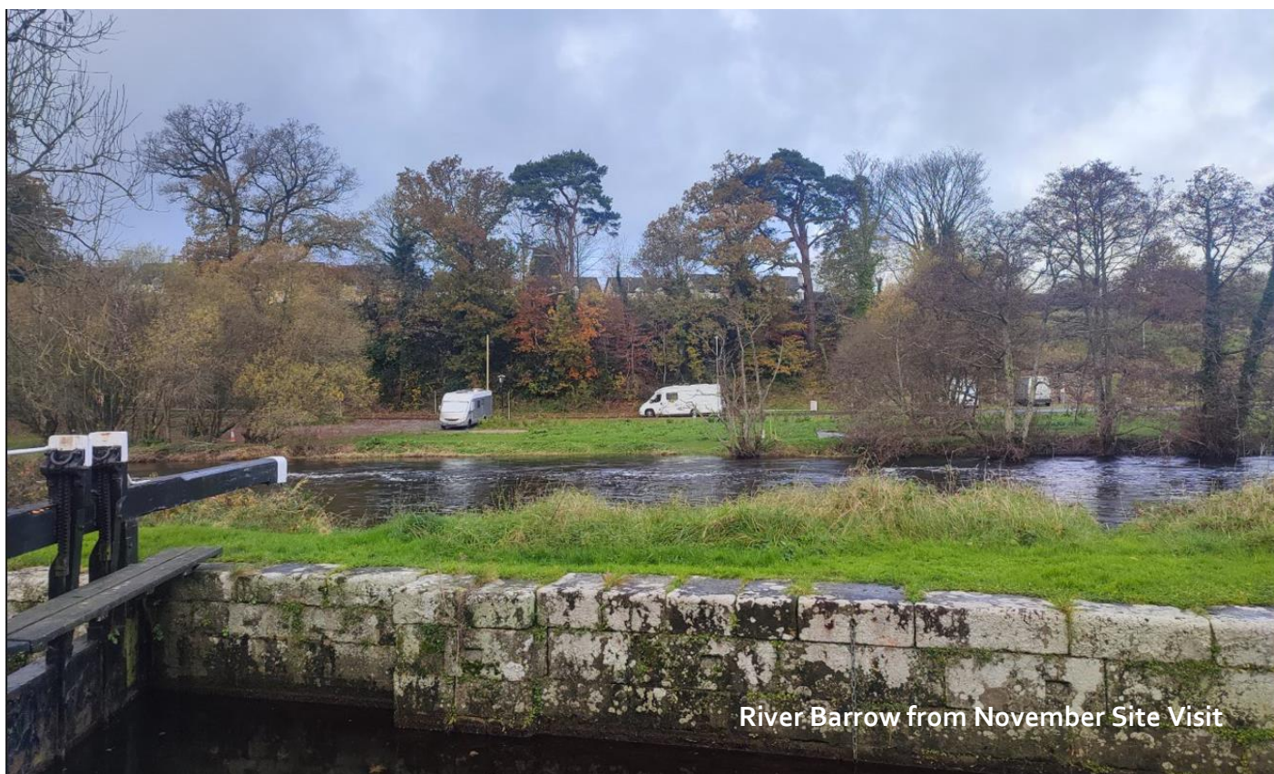
River Barrow from November Site Visit

The scheme is progressing in Stage 1 – Scheme Development and Preliminary Design, this stage is intended to be completed in 2024 and Stage 2 – Planning is due to commence in 2024.