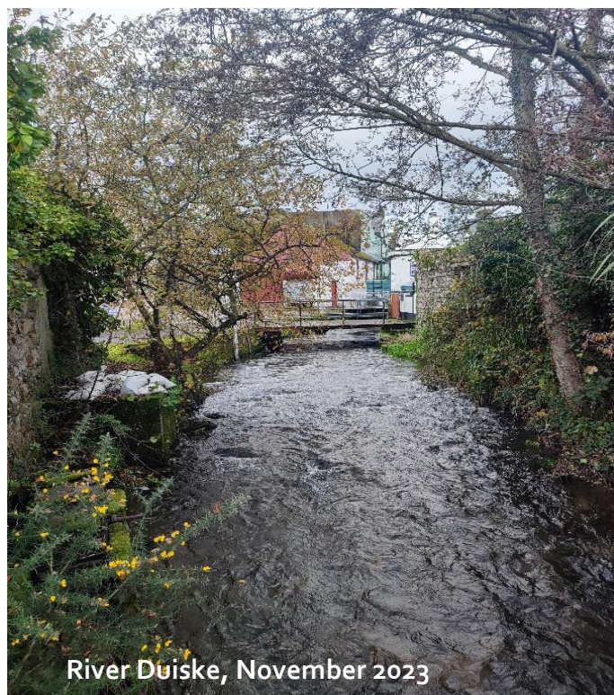
River Duiske, November 2023

At the end of November, the team was on-site to conduct a hydrogeomorphology impact survey of the River Duiske. This survey analysed the riverbed to identify processes associated with flowing water such as areas of erosion, sediment transport and sediment deposition and how the proposed scheme may change such patterns.