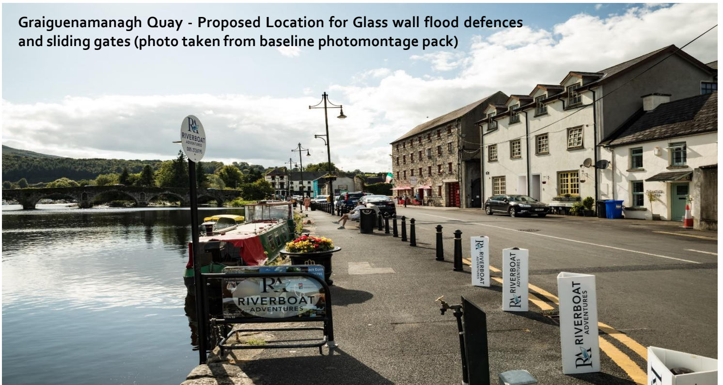
Graiguenamanagh Quay - Proposed Location for Glass wall flood defences and sliding gates (photo taken from baseline photomontage pack)

Flood Relief Works and Stormwater Drainage drawings have been compiled as part of the drainage design. A pump station is to be included which will be activated when the Barrow's water levels are high.