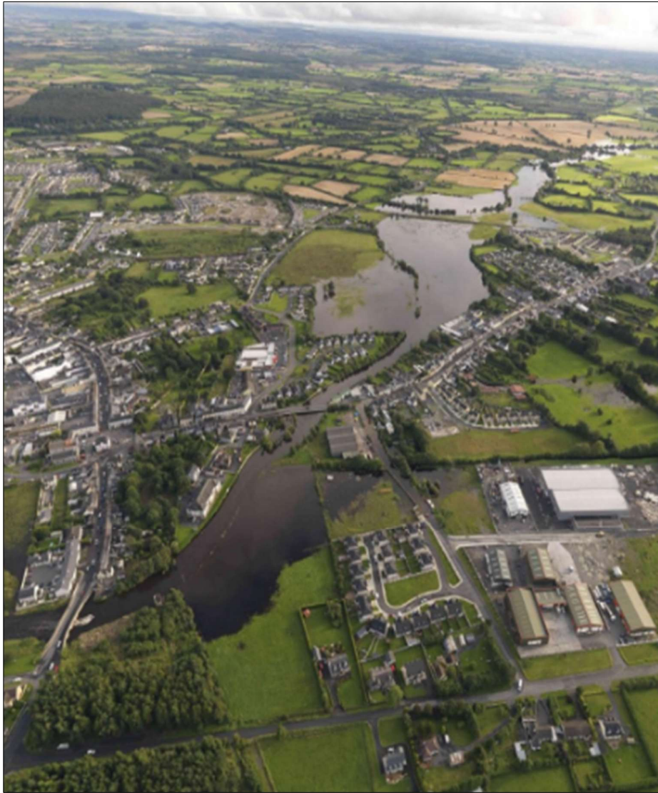
Figure 2 Aerial imagery of flooding in Portarlington in Aug. 2008