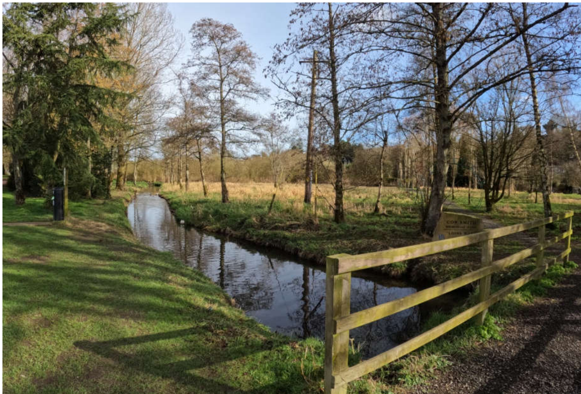
Con Smith Memorial Park – Site Visit February 2023

A Collaborative Workshop is planned for the upcoming period with invited stakeholders to encourage collaboration, do brainstorming, and exchange ideas on how to achieve the project objective while also incorporating other outcomes at the same time into this project.