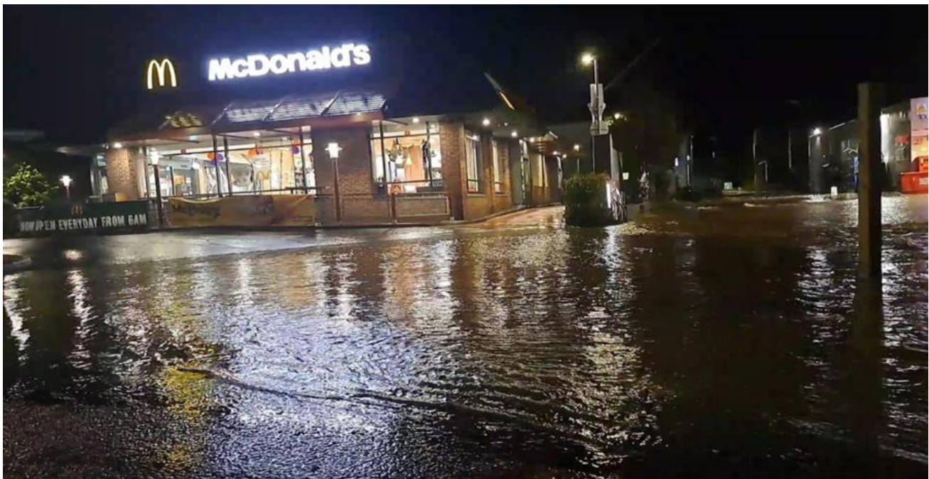
Flood at McDonalds on N3, October 2022

The design standard of protection for the scheme is the 1% AEP fluvial event (1 in 100 year). The design will consider and allow for the impacts of climate change which may be realised over time.