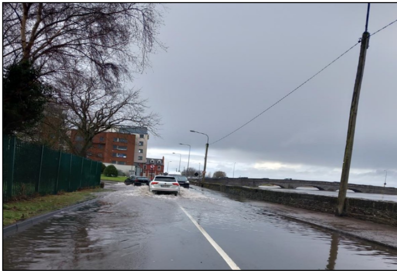
Fairgreen Road - March 2023