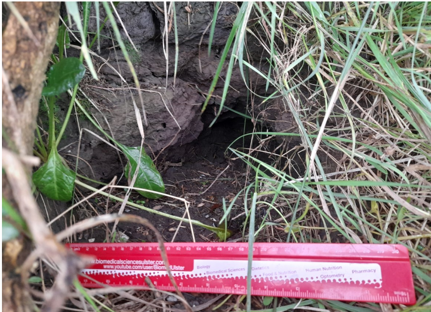
Records from the Terrestrial Mammals Survey in Dundalk

Environmental surveys are now finished in both study areas and the majority of the environmental survey reports have been received and accepted. The most recently received reports have covered snails, bat activity and terrestrial mammals in Dundalk. The Preliminary Environmental Site Assessment Report and the Geomorphology Report are finalised for Ardee.