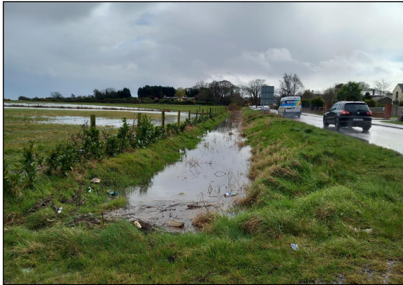
R172 opposite The Loakers / Beaupark Estate - March 2023