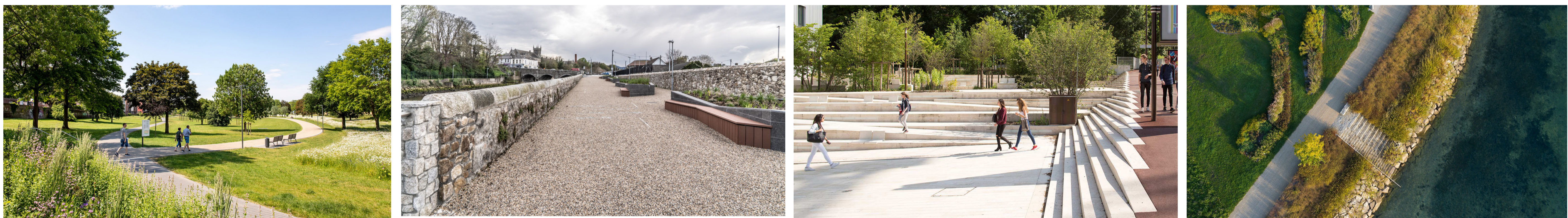
Indicative inspirational images