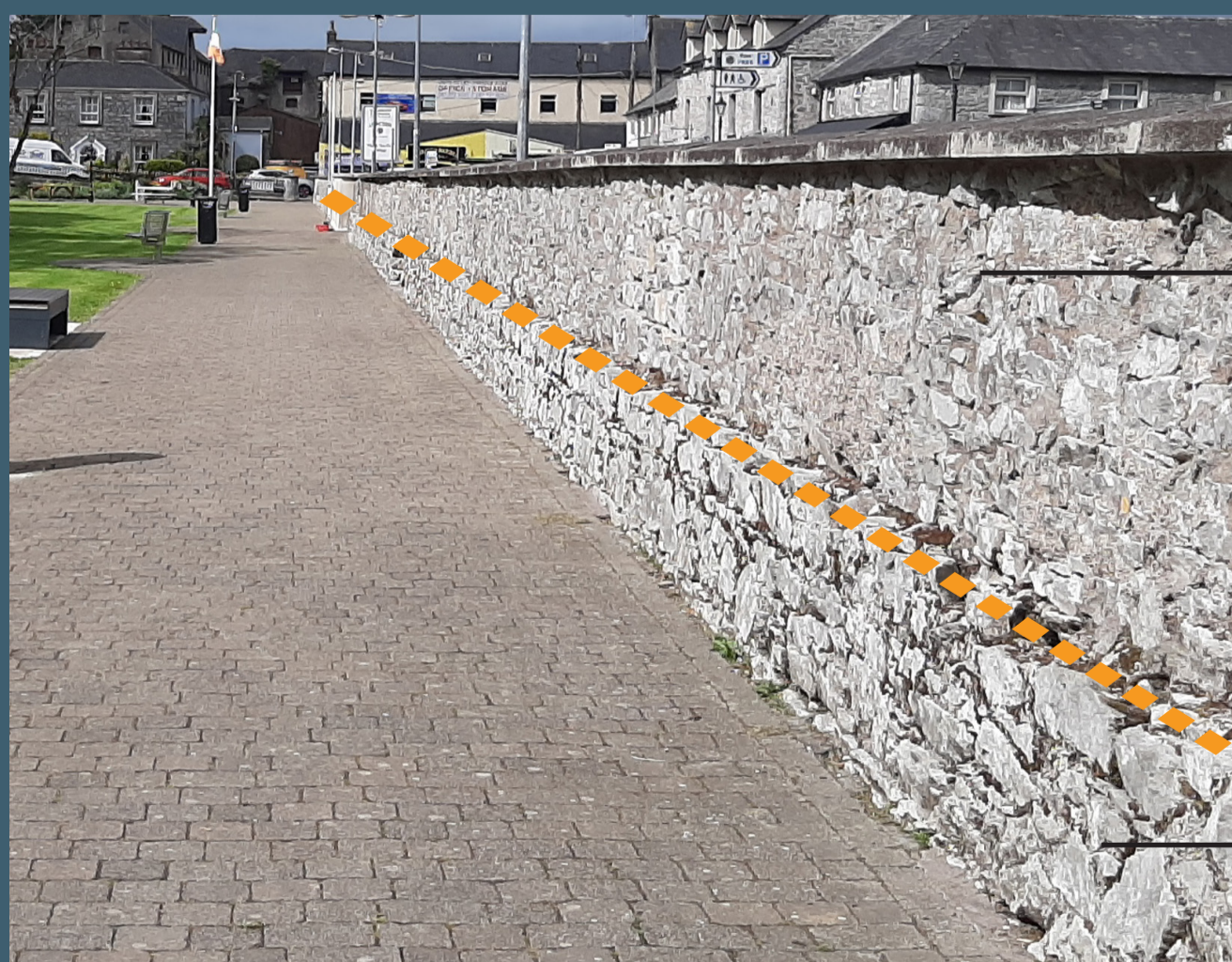
Existing wall along Baby's Walk