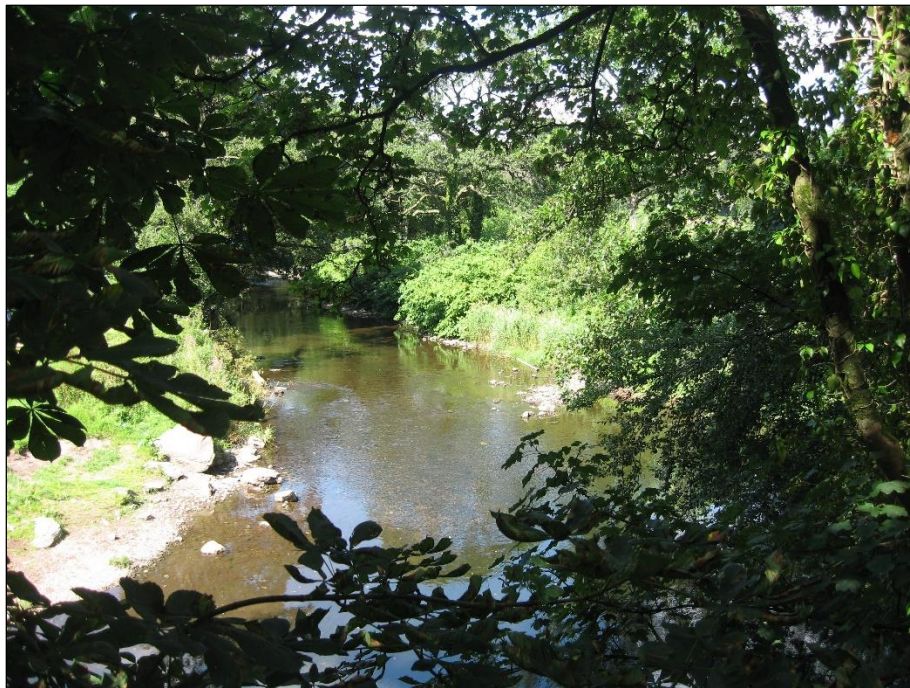
Plate 42: River Glashaboy from the local road running northwest to Riverstown, looking north