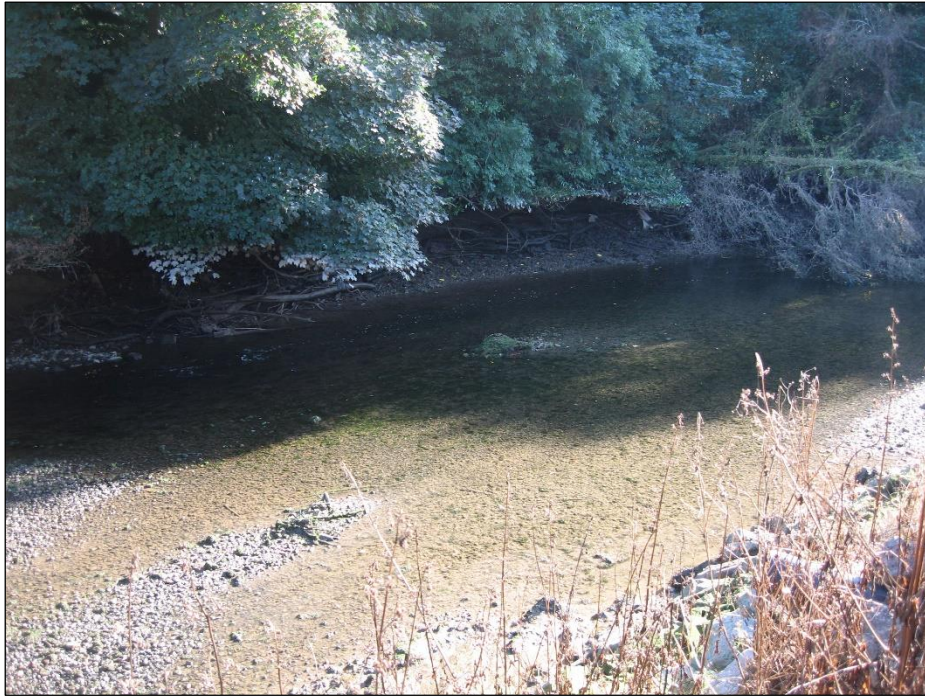
Plate 51: The Glashaboy to the rear of properties in Glanmire village, looking south