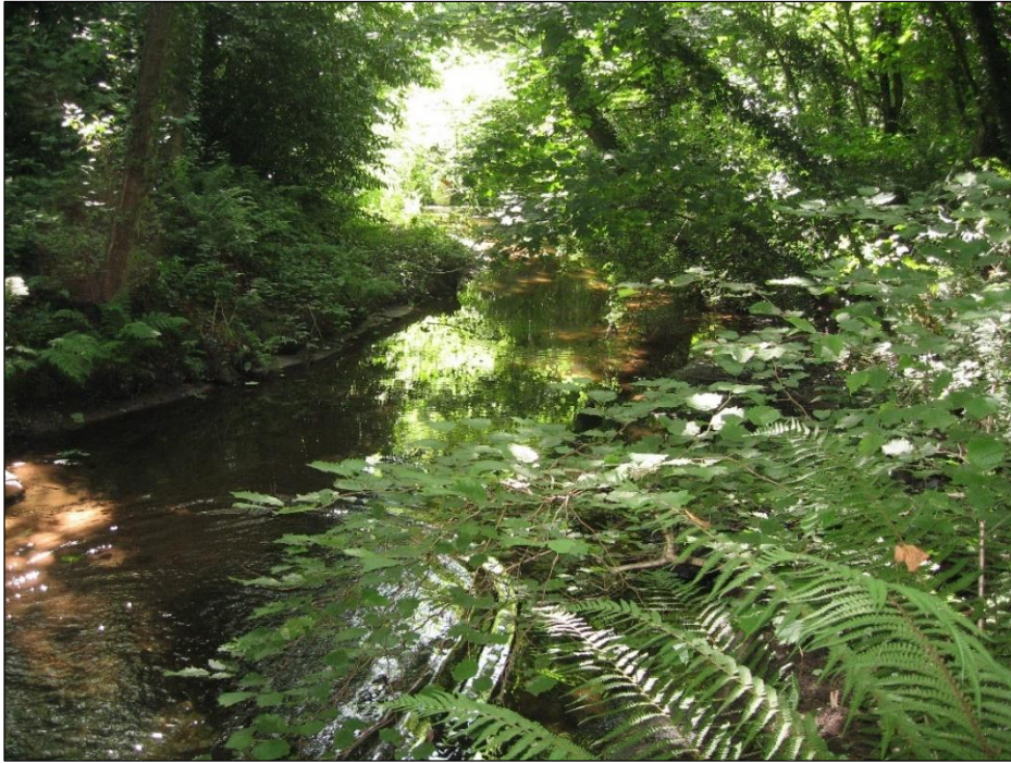
Plate 45: St Patricks mill race downstream of R639 culvert, looking southwest