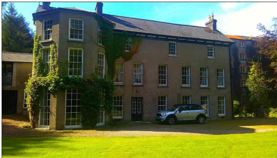
Plate 50: The Fountains northern elevation with mill building visible to the right (after Arup)