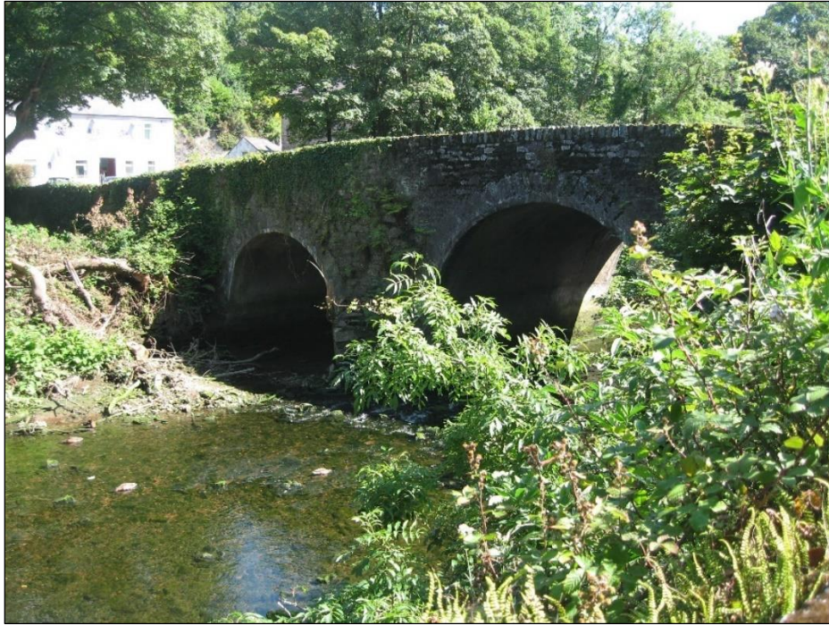
Plate 43: Glanmire Bridge, northern elevation