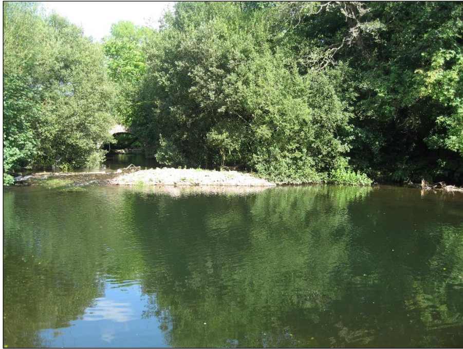
Plate 39: Confluence of the Butlerstown and Glashaboy, looking east