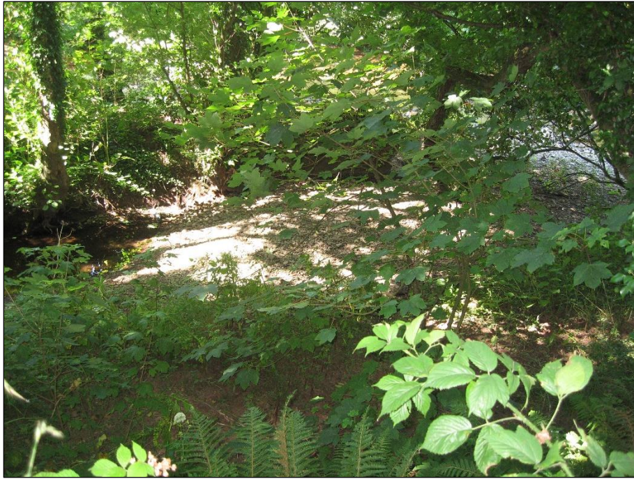
Plate 49: Low bank of stone restricting flow into The Fountains mill race