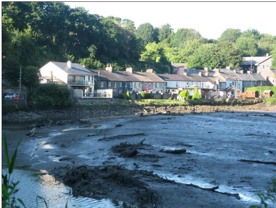
Plate 52: Glashaboy River at low tide behind properties in Glanmire village, looking northeast