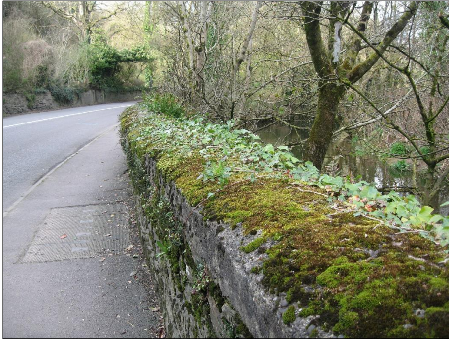
Plate 41: River Glashaboy beside the R639 road, looking north