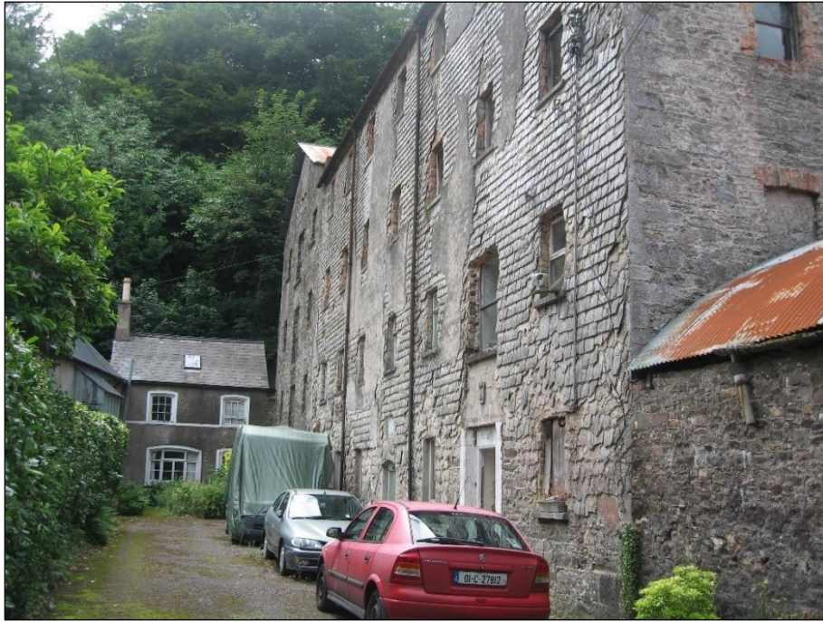
Plate 47: St Patrick's Mill complex and mill house, looking west