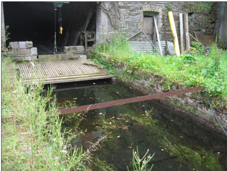
Plate 46: Mill race in St Patrick's Mill, looking south