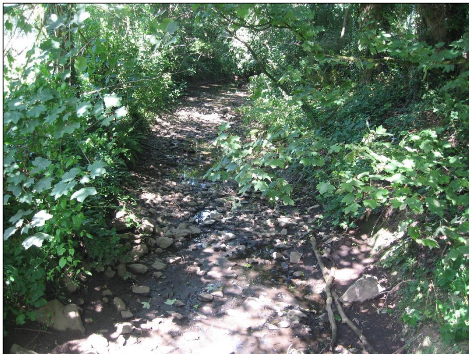
Plate 48: The Fountains mill race, looking south