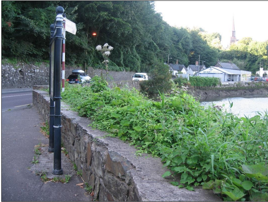
Plate 53: Wall along R639 with river to right, looking north