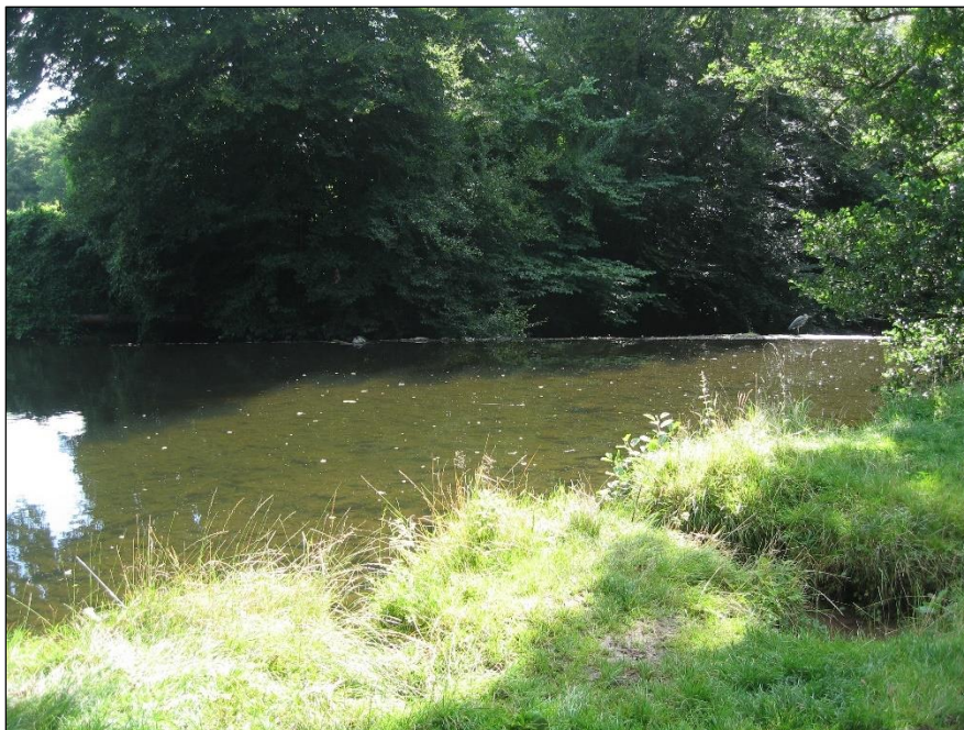
Plate 40: Weir at opening of St Patrick's Mill mill race, looking south