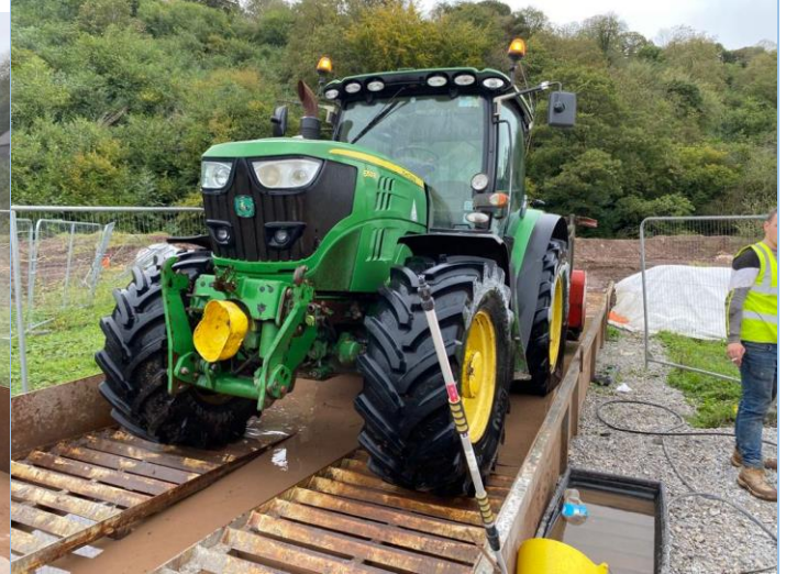
Caption 14 Section