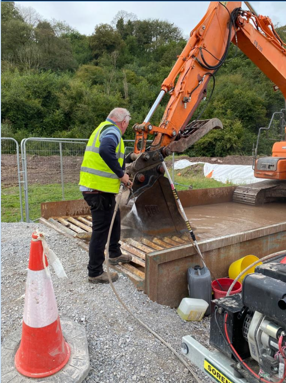
Caption 15 Section