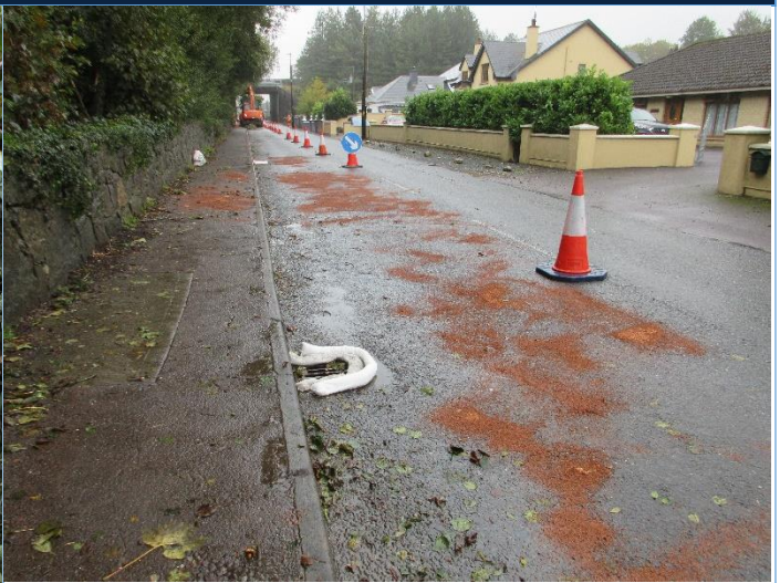
Caption 4 Section

Emergency spill response at New Line Road (5 th Oct) Spill contained with absorbent granules and drains banded.