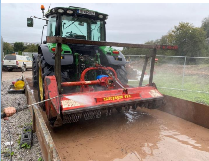
Caption 13 Section