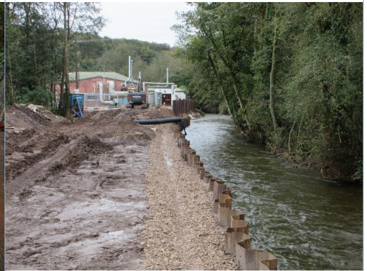
Caption 6 Section

Stone placed at Sallybrook discharge point to prevent eroding of ground and silting of water.