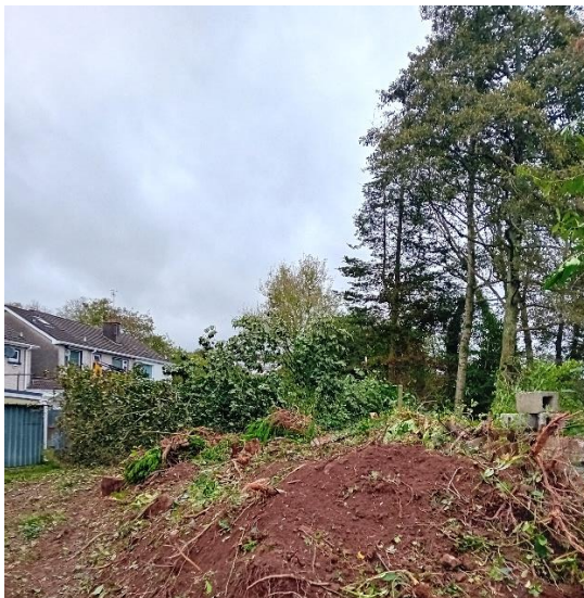
Caption 7 Section

Ivy-covered tree felled 10 th Oct – left on ground until 13 th Oct.