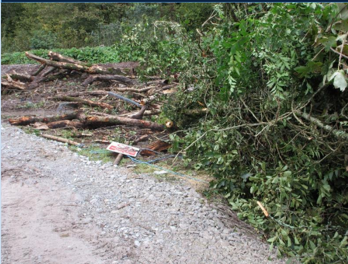
Caption 3 Section

Unsatisfactory management of Japanese Knotweed Exclusion Zone