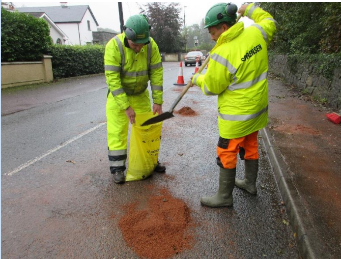
Caption 5 Section

Contaminated granules removed by hand and double bagged for disposal.