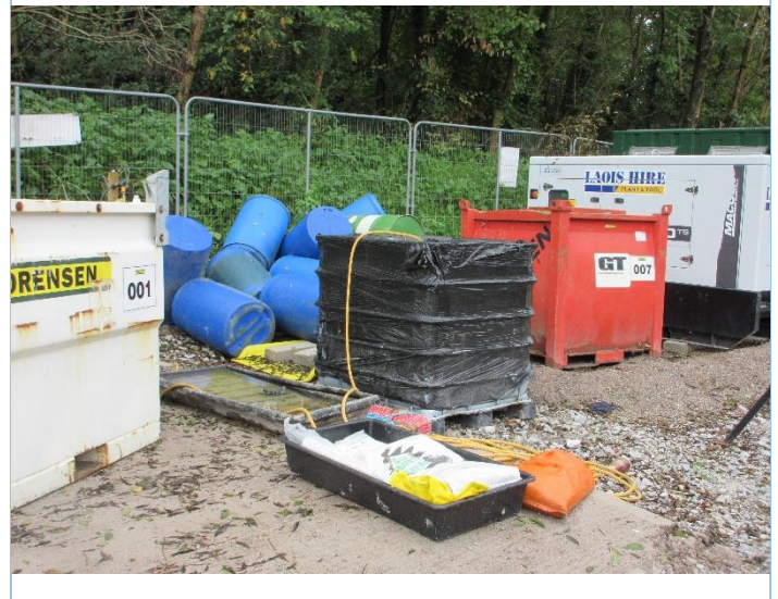
Caption 8 Section

Incorrect storage of waste drums – Area 1 compound