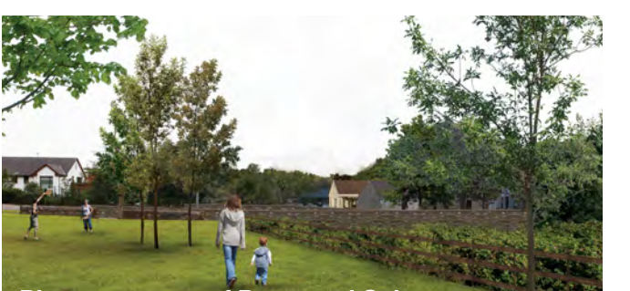
Photomontage of Proposed Scheme North of Hazelwood Centre near Basketball Court