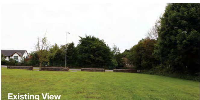
North of Hazelwood Centre near Basketball Court