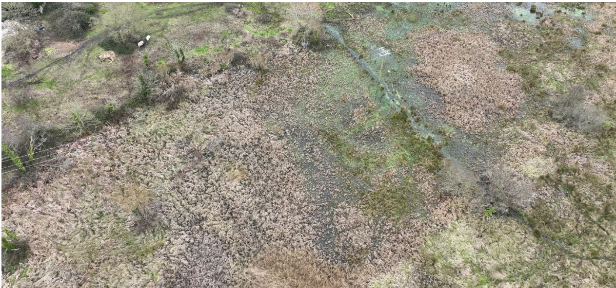
Overview of the Marsh

A campaign of Archaeological Testing and monitoring is to begin alongside the site investigation contract to resolve and identify any artifacts or sites that will be impacted by the works. Two assessments are ongoing: a terrestrial based testing and an underwater assessment. All works are being undertaken in coordination and under licence from the National Monuments Service.