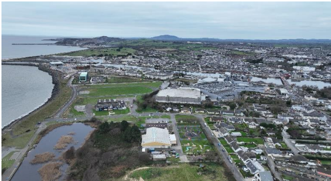
Arklow drone imagery from the North side of the Avoca River

Following a public procurement process, Surveyors have been appointed to perform the topographical, utility and ground penetrating radar surveys for the Arklow Flood Relief Scheme. Teams of surveyors are performing surveys to determine changes in elevation, terrains, contours, boundaries and obstructions to allow detailed design to be carried out.