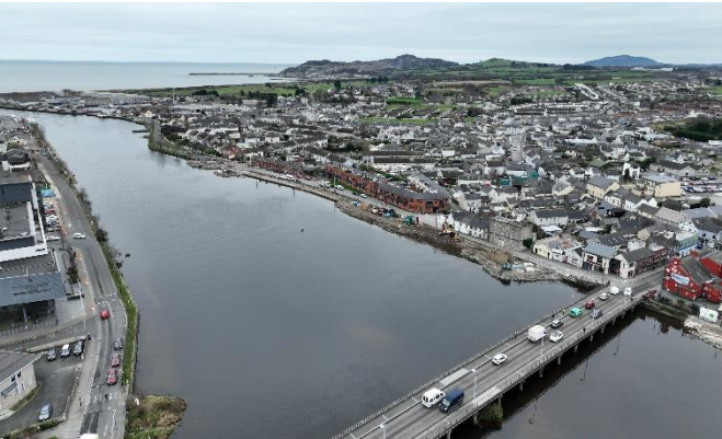
Avoca River downstream of the nineteen arches bridge