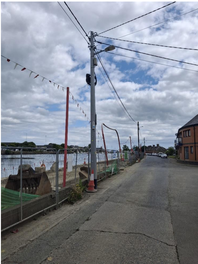
ESB overhead electrical cables to be diverted in the scheme

Project Teams from Arklow FRS and ESB have met onsite to discuss diversion of electrical cables that will be required to facilitate the construction of the scheme.