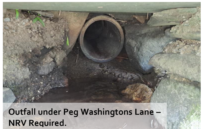
Outfall under Peg Washingtons Lane – NRV Required.