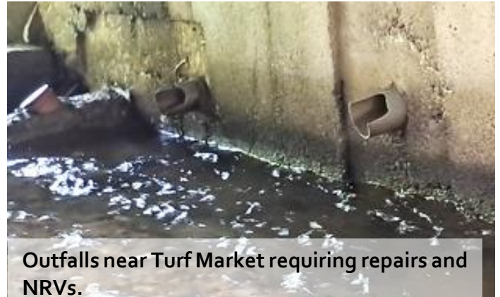
Outfalls near Turf Market requiring repairs and NRVs.

Overall, the pipes were in good condition. Deformed sections and vegetated growth was captured in some of the pipes. The surveys have been shared with Uisce Eireann.