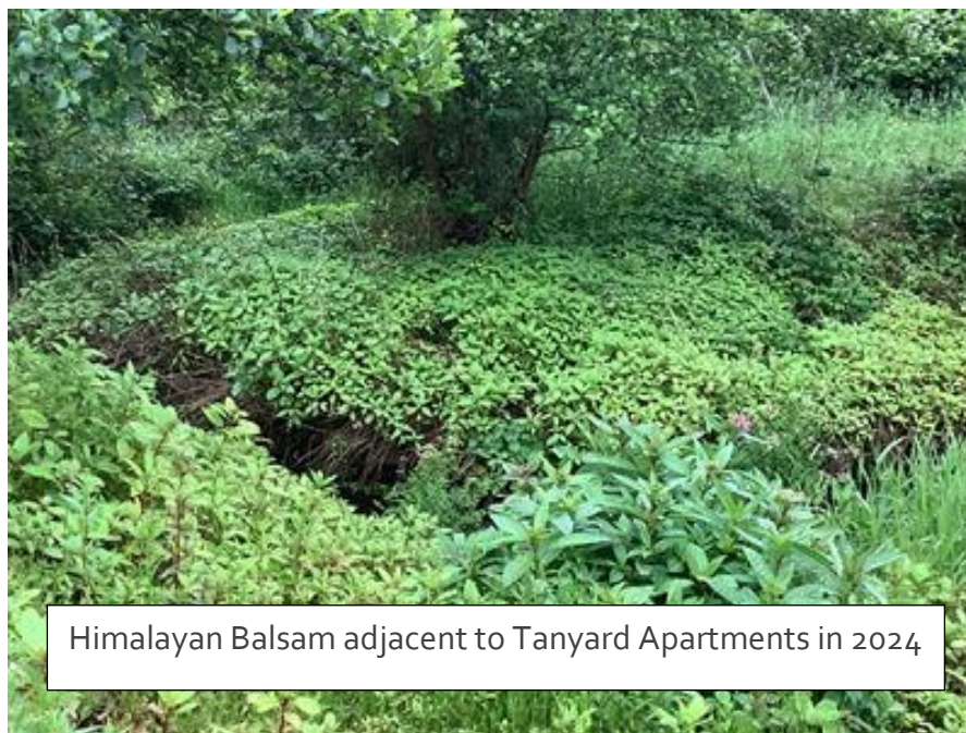
Himalayan Balsam adjacent to Tanyard Apartments in 2024

Once the emerging preferred option is known specialist environmental surveys, including cultural heritage, noise & vibration, air quality, and landscape & visual will progress.