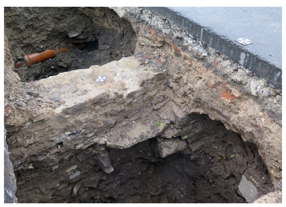
Figure 59 Wall crossing TT6-3 (C6-3-09)