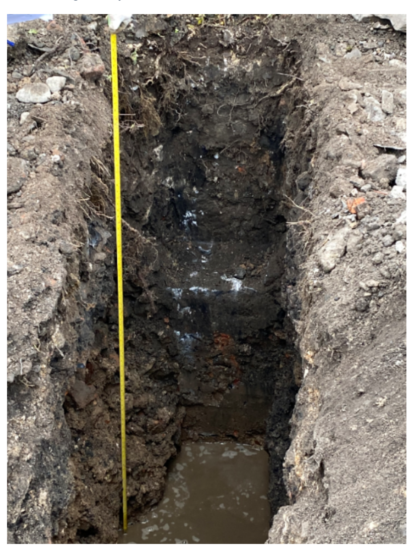
FIP 304 Georges Quay