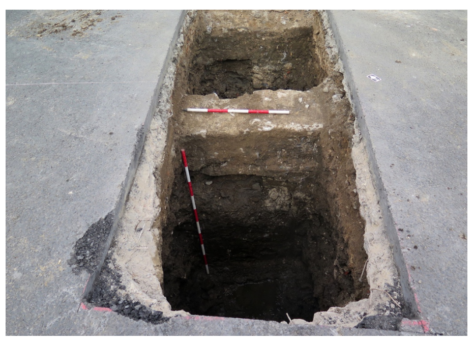
Wall crossing TT6-3 (C6-3-14)