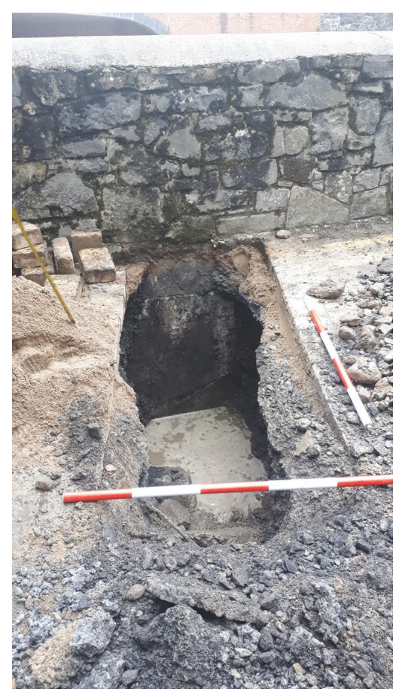
Quay wall FIP 303 Sir Harrys Mall