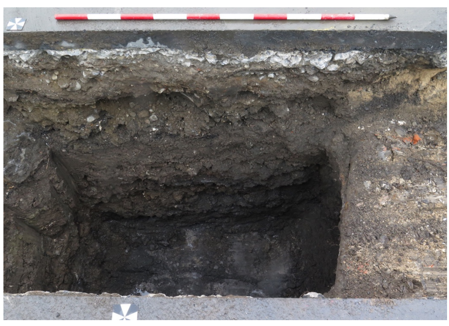
Figure 63 Basal soil fill in TT6-4 (C6-4-11)