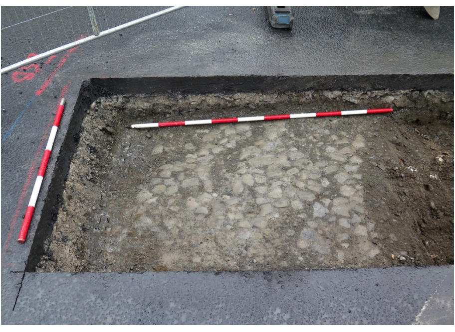
Figure 61 Cobbled surface in TT6-4 (C6-4-04)