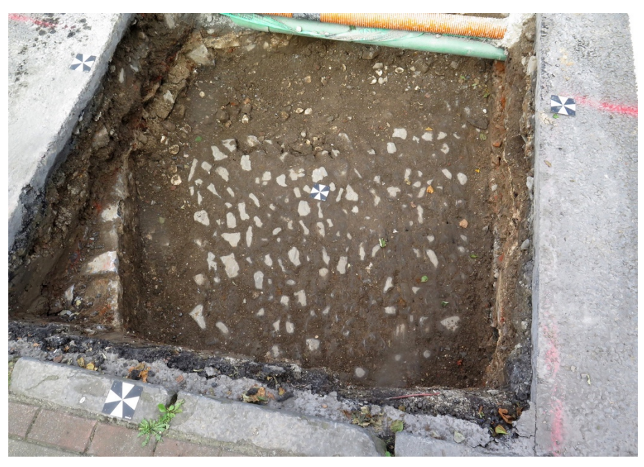
Figure 56 Cobbled surface in TT6-2 (C6-2-06)