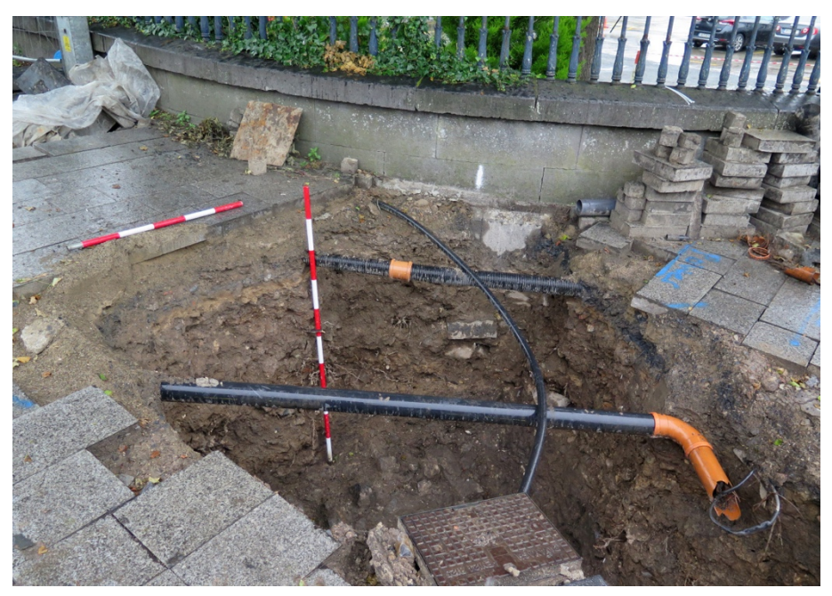
Potato Market wall along the west of TT6-1 (C6-1CD-09)