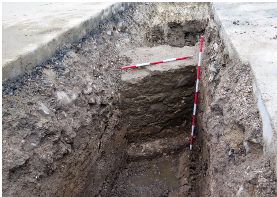
Figure 37 Wall in TT4-4 (C4-4-07)