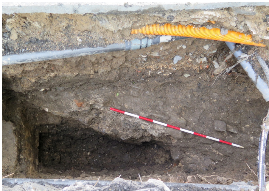
Figure 54 Wall running along the east of TT6-1 (C6-1CD-09)