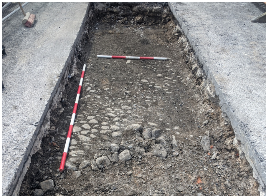
Figure 41 Cobbled surface in TT5-1A (C5-2A-04)