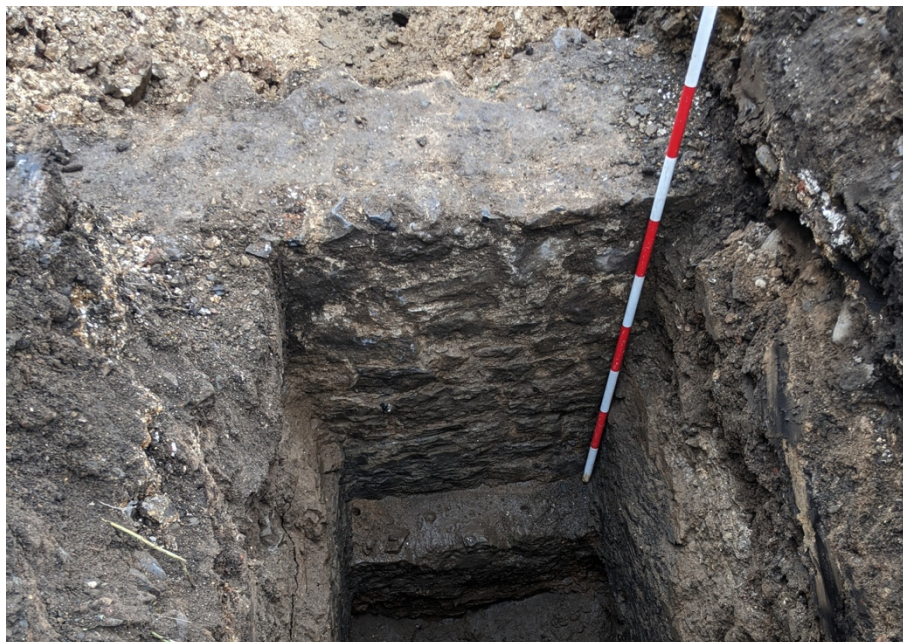
Figure 36 Wall in TT4-1 (C4-1-16)