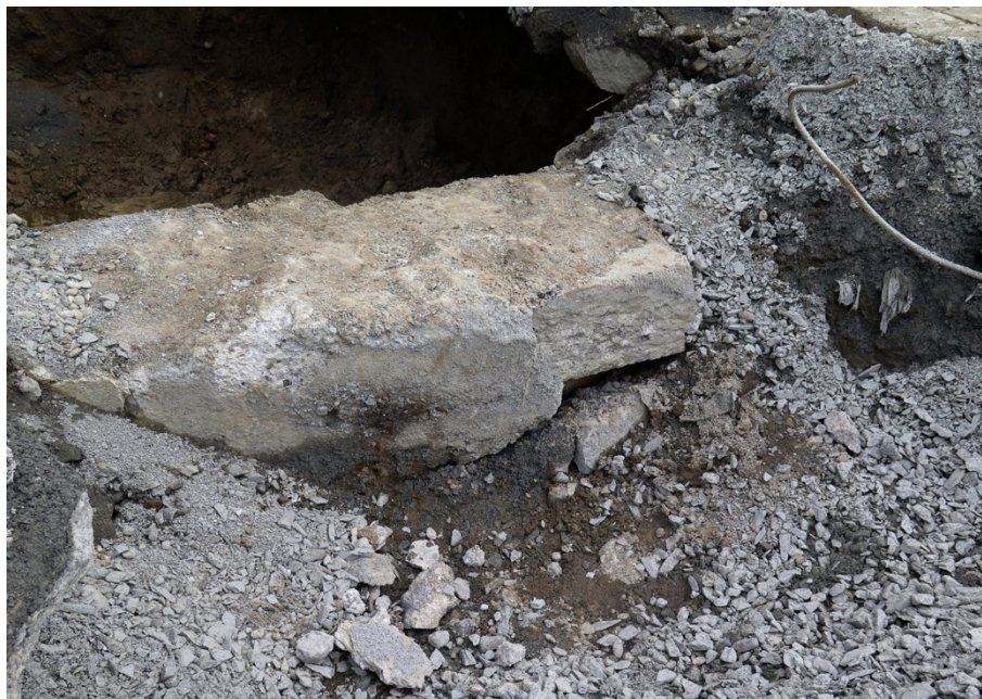
Figure 35 Wall in TT3-1 (C3-1-08)