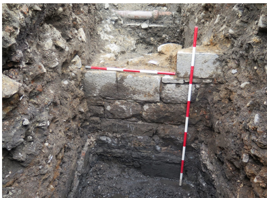
Figure 46 Wall in TT5-3 (C5-3-13)