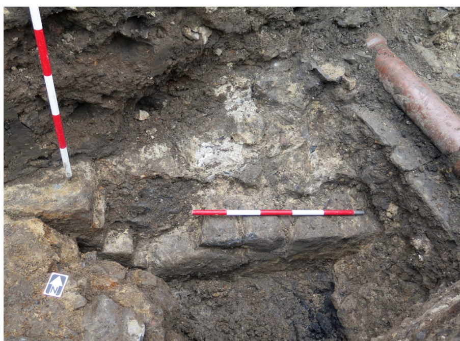
Figure 47 Wall in TT5-3 (C5-3-14)