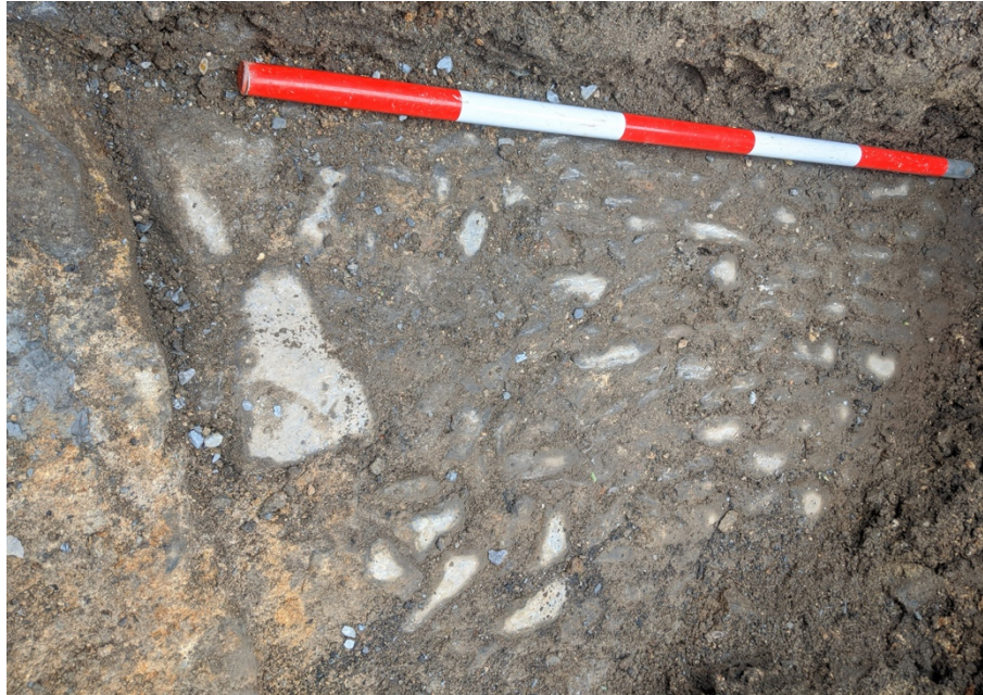
Figure 51 Cobbled surface in TT6-1 (C6-1AB-07)