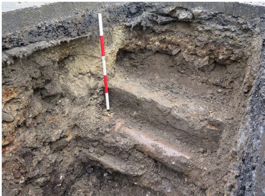
Figure 44 Culvert at the east of TT5-2C (C5-2C-09)