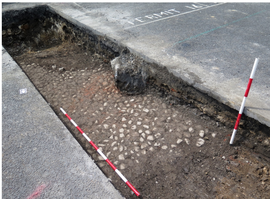
Figure 38 Cobbled surface in TT5-1A (C5-1A-07)