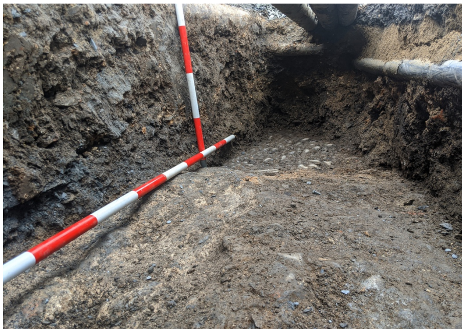
Figure 52 Mortared surface in TT6-1 (C6-1AB-08)