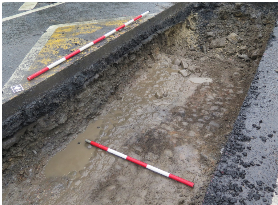
Figure 43 Cobbled surface in TT5-1C (C5-2C-06)