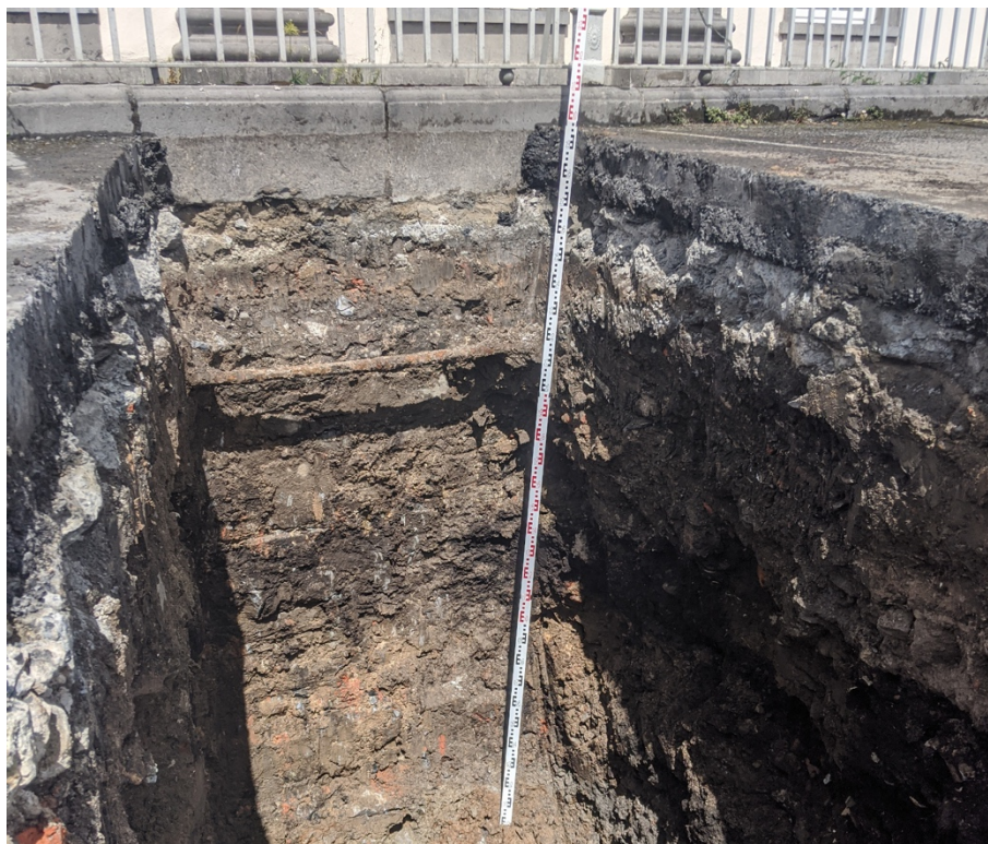
Figure 40 Culvert at the north of TT5-1B (C5-1B-11)