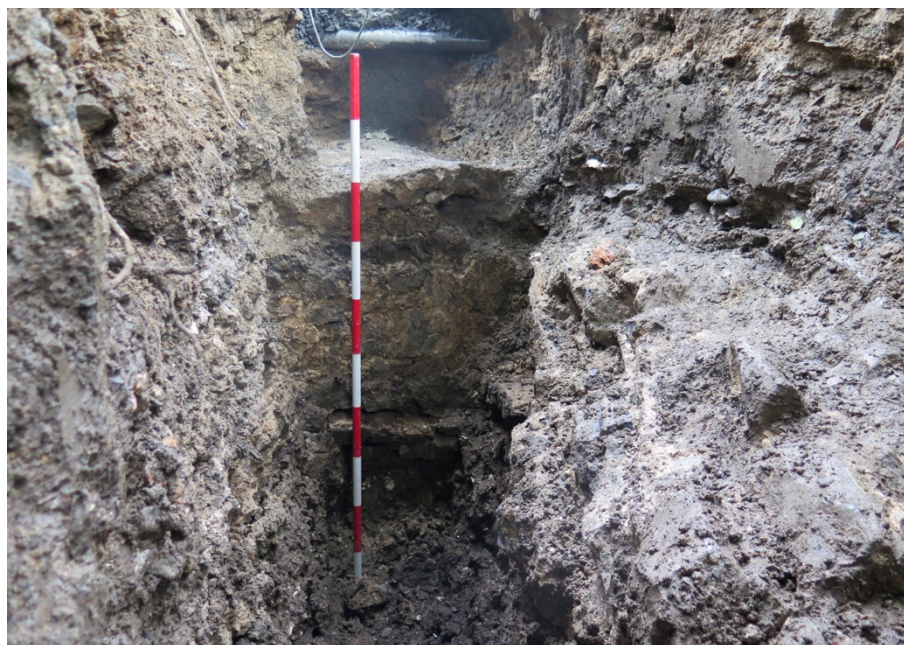
Figure 53 Wall running across the centre of TT6-1 (C6-1CD-08)