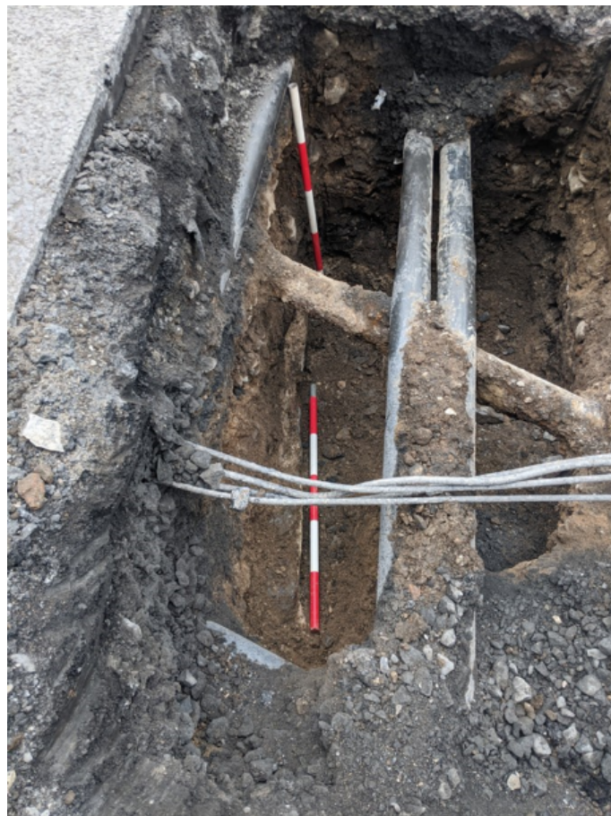
Figure 50 Wall foundation TT6-1A looking north.