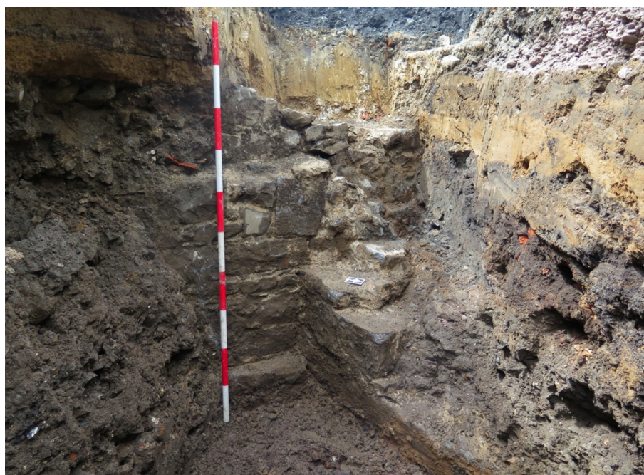
Figure 48 Walls in the west of TT5-5 (C5-5-12) and (C5-5-13)