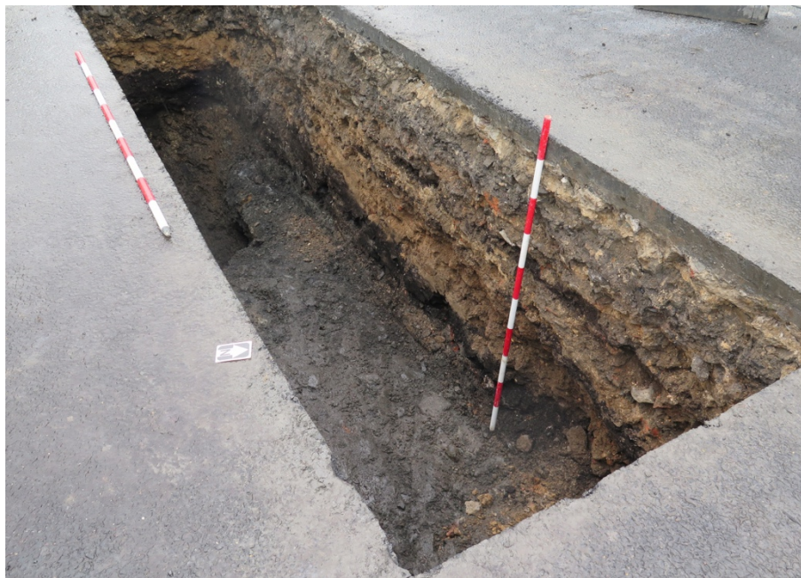
Figure 42 Stone surface in TT5-2A (C5-2A-11)