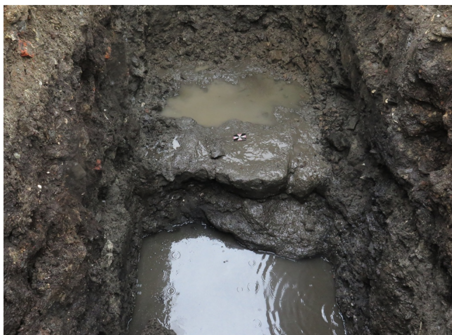
Figure 45 Wall in TT-2C (C5-2C-13)