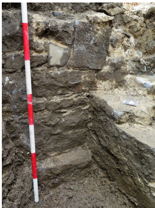
Figure 49 Detail showing junction of walls in the west of TT5-5 (C5-5-12) and (C5-5-13)