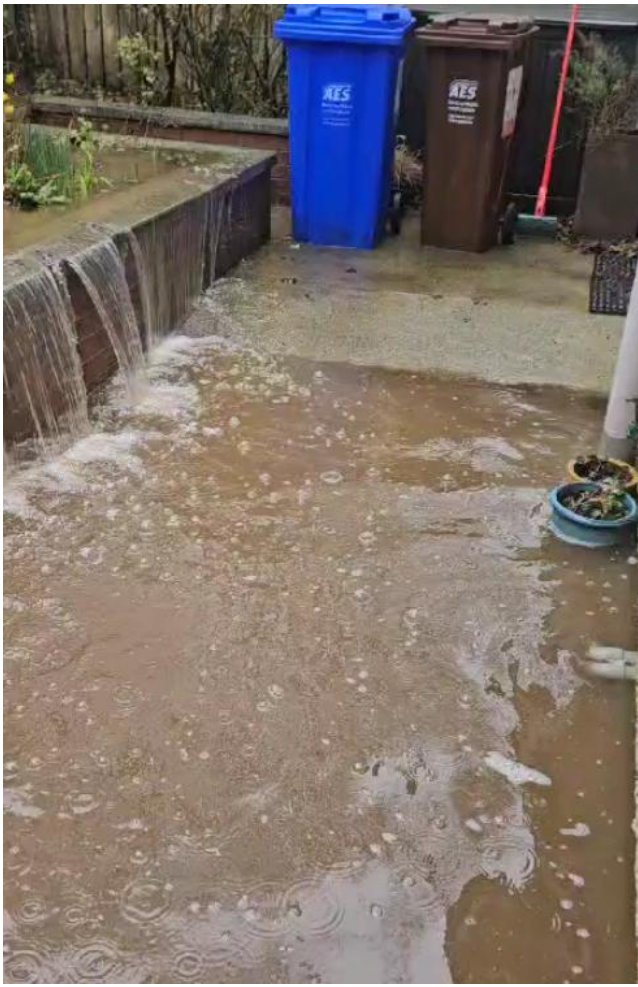
Flooding at Boru Court Properties