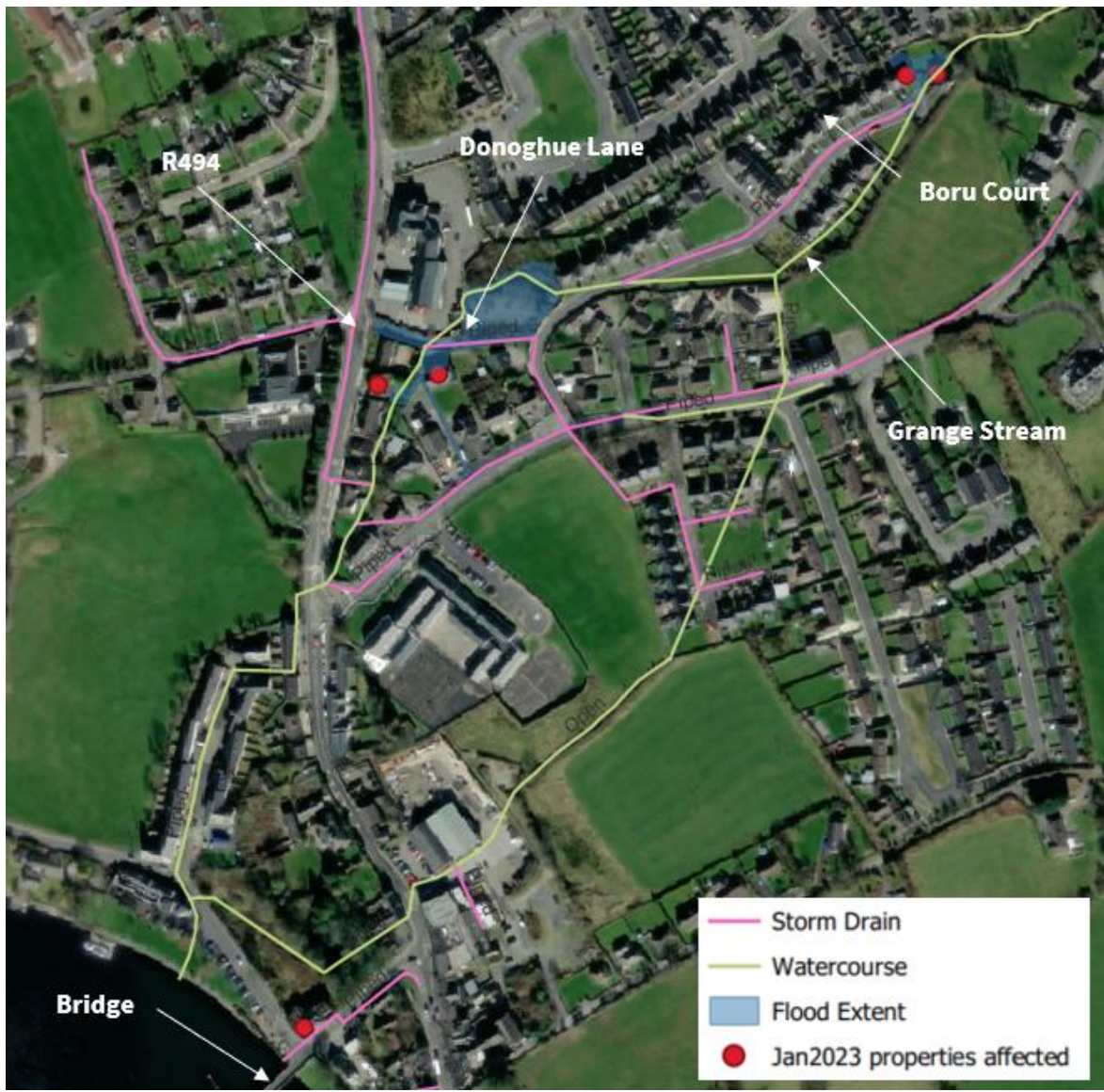
10/11 th January 2023 - Flood Extent and Affected Properties