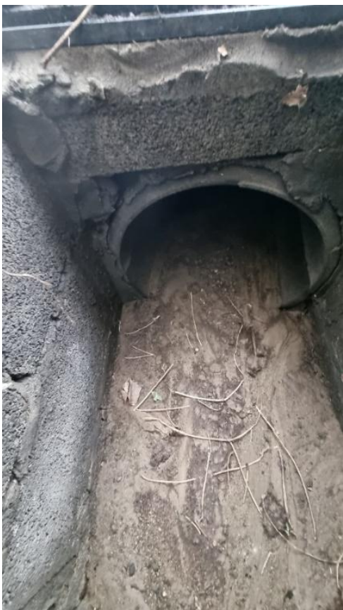
Inlet to Grange Stream immediately upstream of Boru Court (31/01/23)