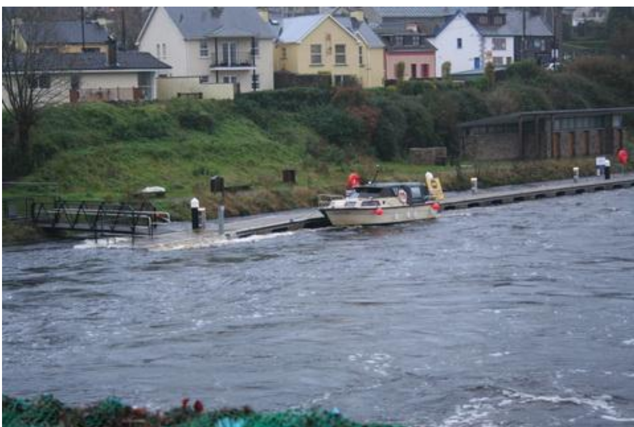
Ballina Pontoon under water

There are reports online of a flood event occurring in January 2016. The Ballina pontoon was identified as being underwater.