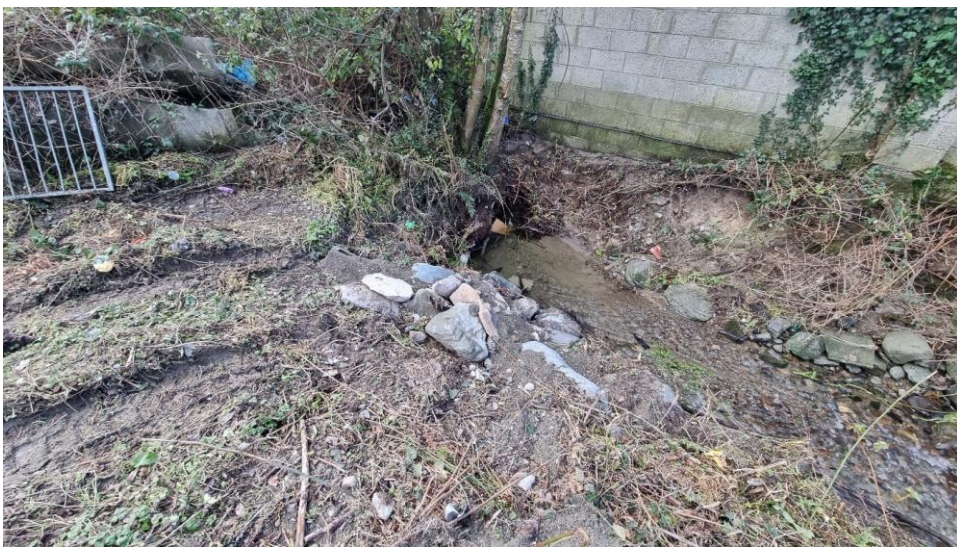
Inlet to pipe at site near Donoghue Lane following flood event