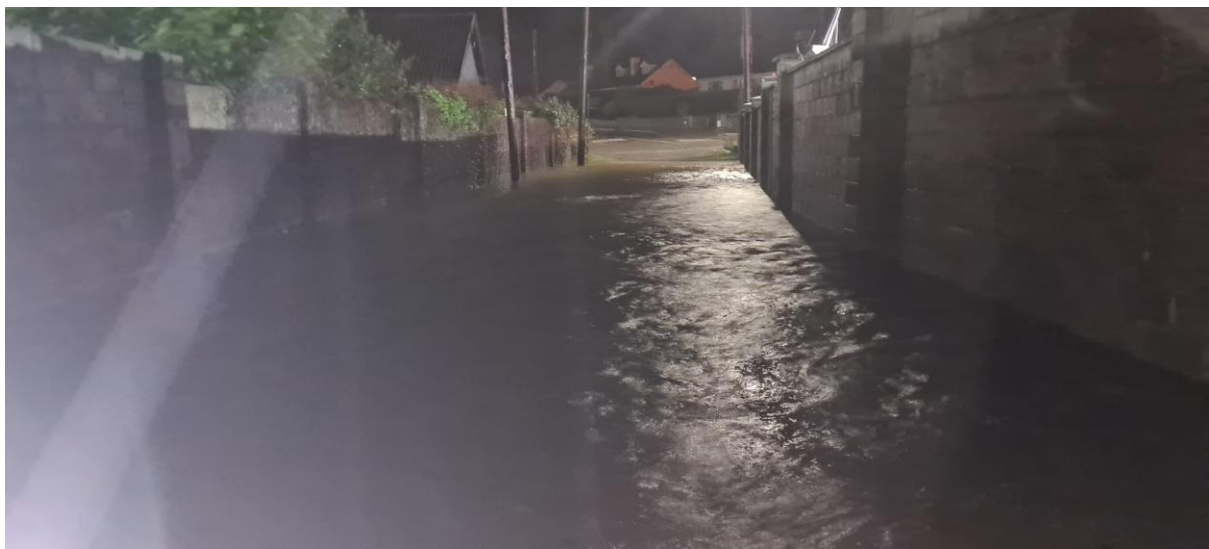
Flooding on Donoghue Lane