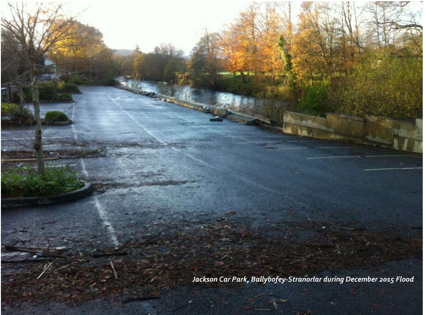
Jackson Car Park, Ballybofey-Stranorlar during December 2015 Flood

Donegal County Council commissioned ByrneLooby in May 2021, to develop and implement a Flood Relief Scheme for Ballybofey and Stranorlar.