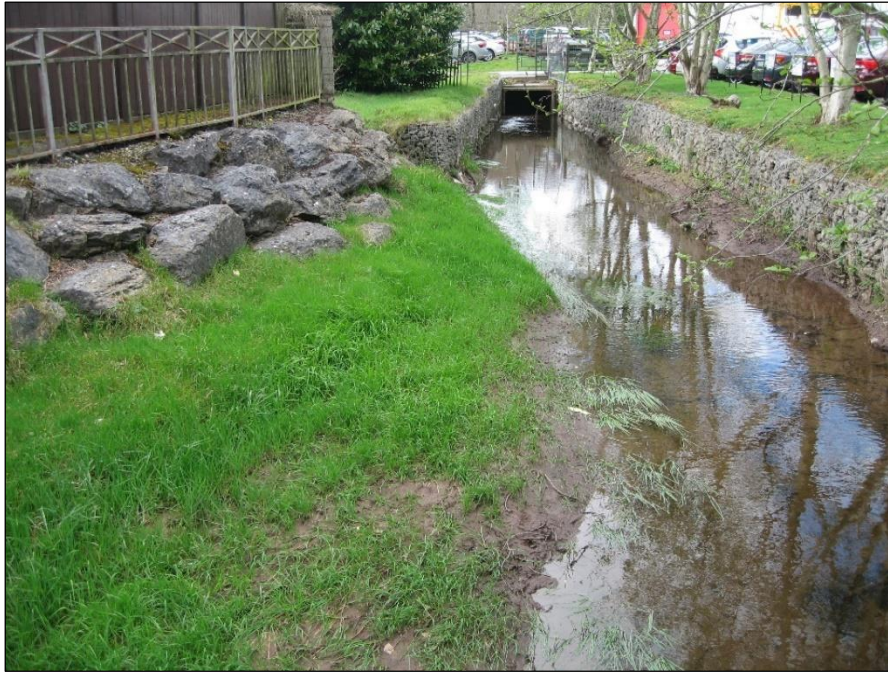
Plate 7: Mill race 3 in Grandon's Garage property, emerging from culvert, looking northwest