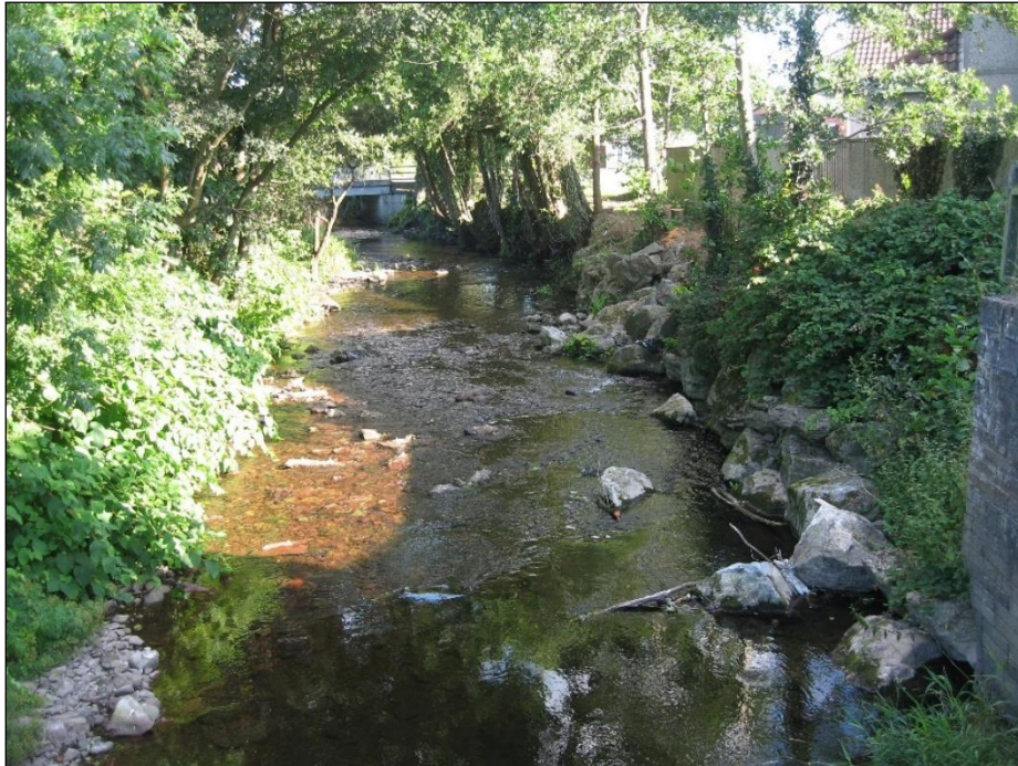
Plate 17: View downstream from Hazelwood Avenue bridge