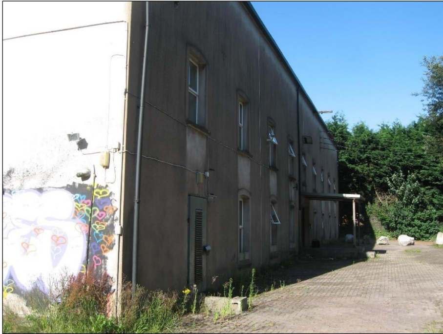
Plate 3: Sallybrook Mill, south elevation