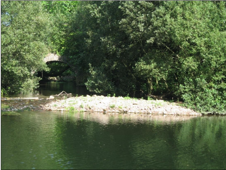
Plate 29: Western elevation of Glyntown Bridge at the confluence of the Butlerstown and Glashboy