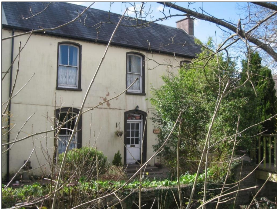
Plate 4: Sallybrook House, east elevation