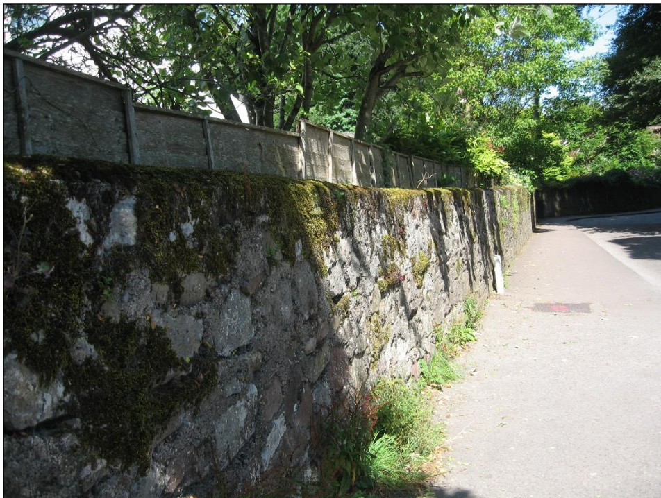
Plate 28: Wall to east of Riverstown Bridge