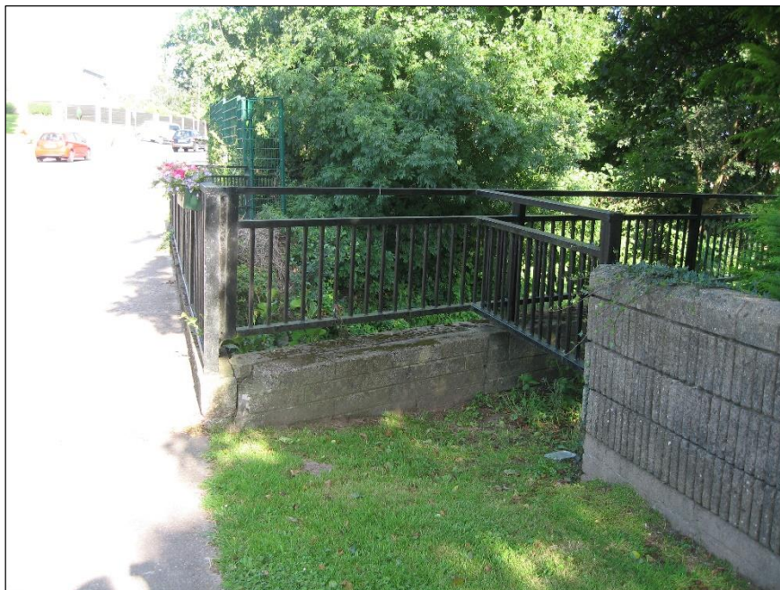
Plate 16: Overgrown area to east of bridge where relief channel will be constructed, looking north