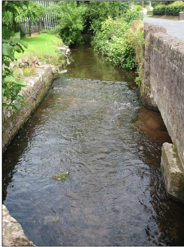
Plate 33: Glenmore Stream eastern section with Brooklodge Grove Road to south (right). Opening to the rectangular culverted channels are visible at bottom right, looking east