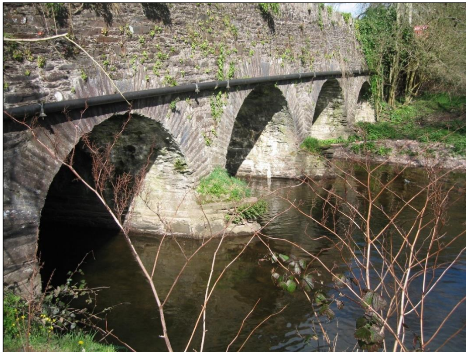
Plate 36: Riverstown Bridge, southern elevation