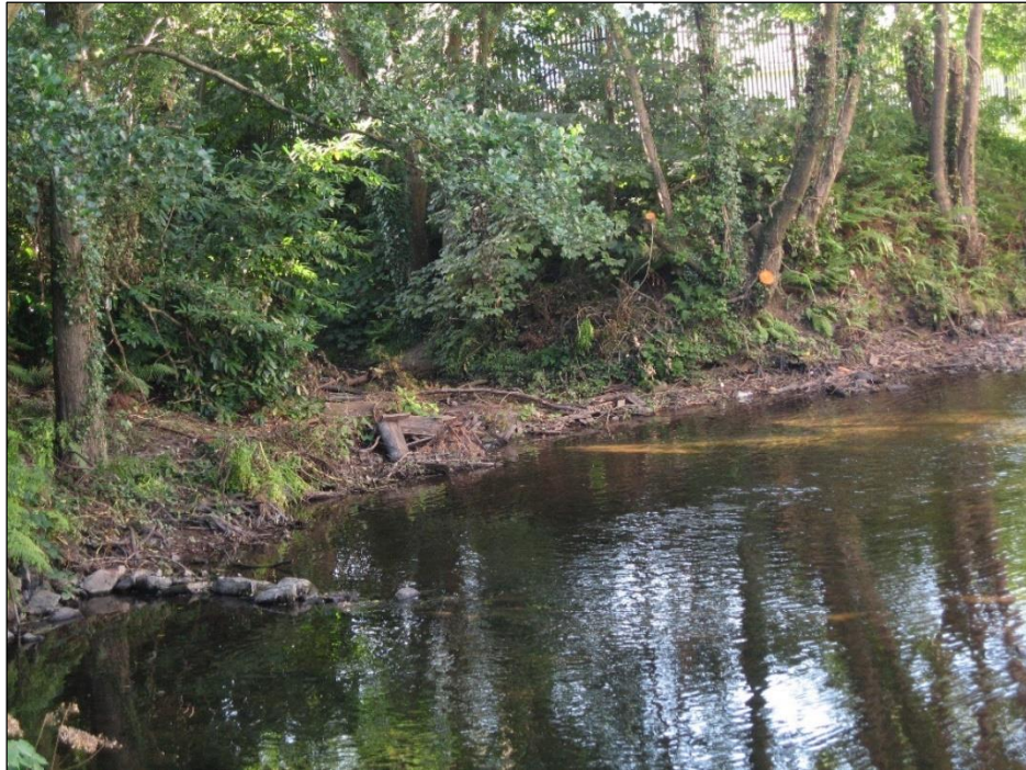
Plate 23: Springmount Stream at convergence with Glashaboy River, looking northwest