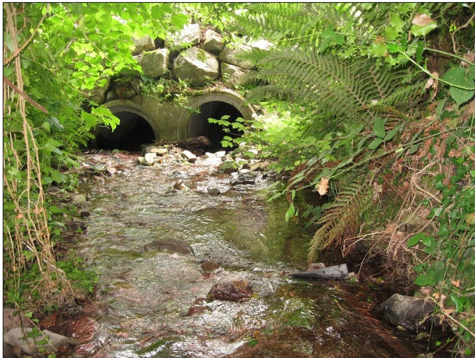
Plate 2: Bleach Hill Stream, entering culvert under road, looking southwest