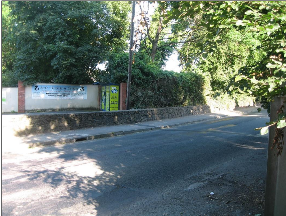
Plate 21: View of R639 where Springmount Stream is culverted. The stream re-emerges behind the hedgerow parallel to the road within the trees