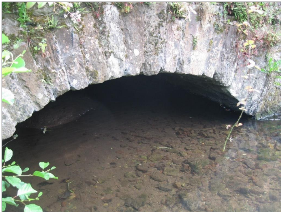
Plate 34: Eastern culvert opening, north-facing elevation