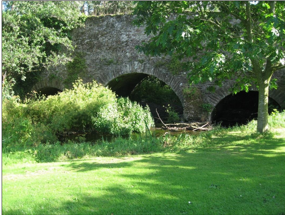
Plate 31: Northern elevation of Copperalley Bridge in grounds of Riverstown House