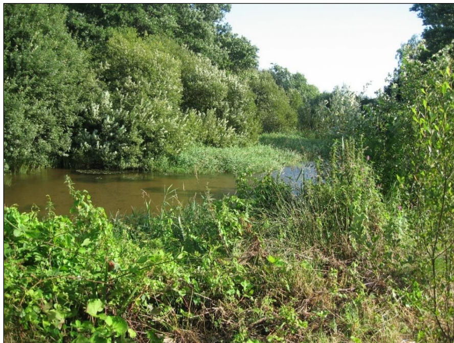
Plate 8: Mill race 3 on the southern side of R639, north of Glansillagh Mill (CO063-094)