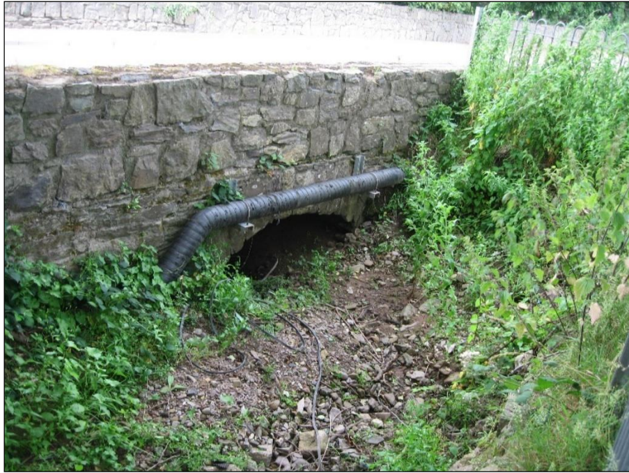
Plate 35: Eastern culvert opening, showing dry south-facing elevation