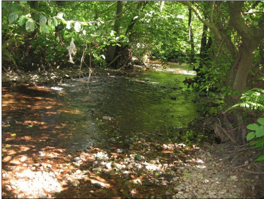
Plate 37: The Glashaboy in John O'Callaghan Park, looking east