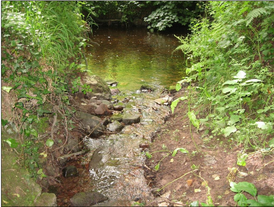
Plate 9: Unnamed channel around Sallybrook House entering the Glashaboy River, looking west