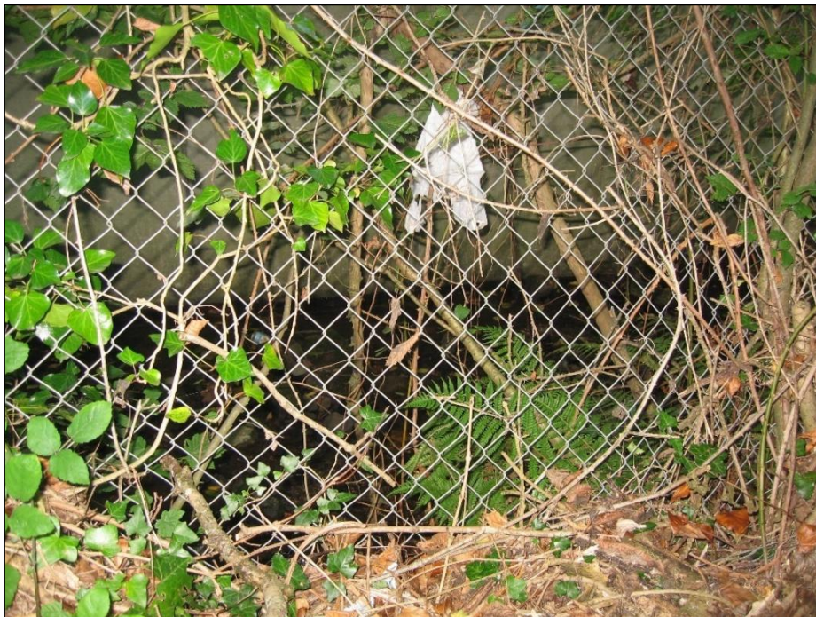
Plate 22: Open channel of Springmount Stream north of Meadowbrook, looking north