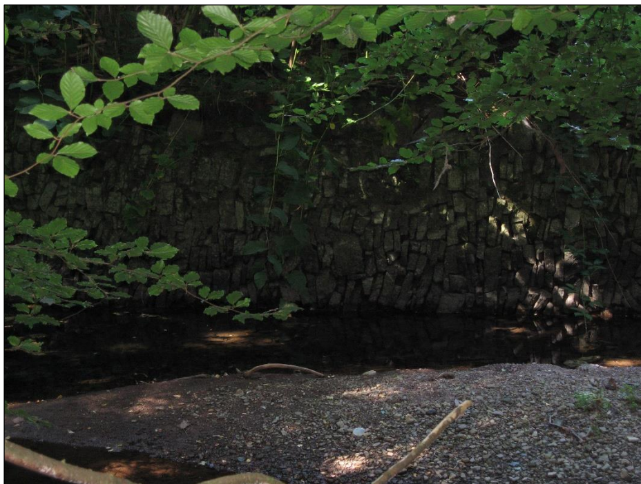
Plate 38: Stone faced bank, looking east