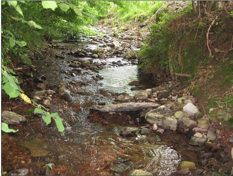
Plate 1: Bleach Hill Stream, looking southwest