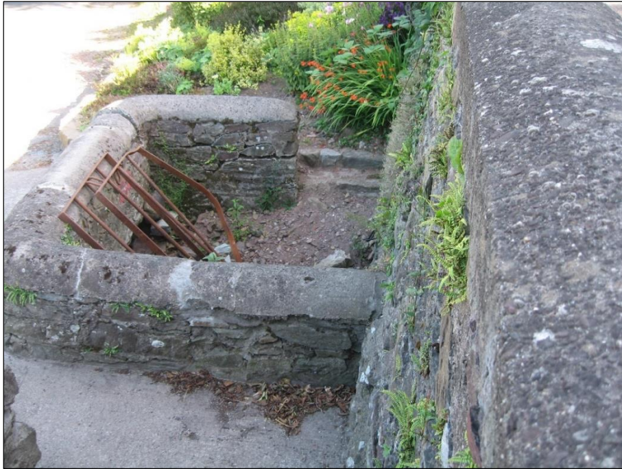
Plate 11: Stone lined well around Cois na Gleann Stream, looking south