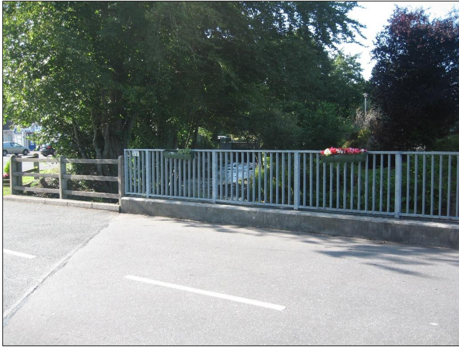
Plate 19: View of bridge in Glanmire Shopping Centre, looking south