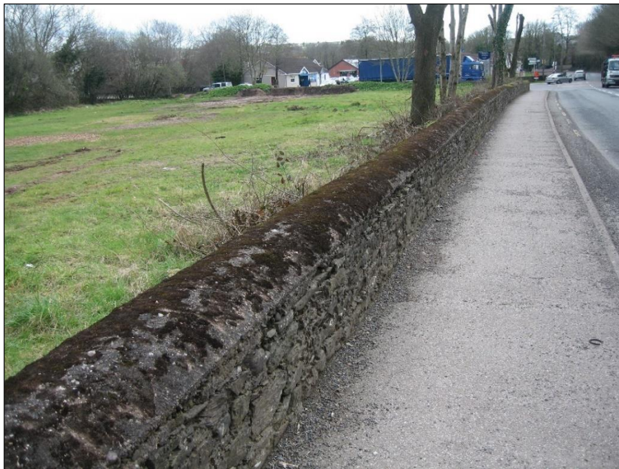
Plate 14: Wall along western side of field