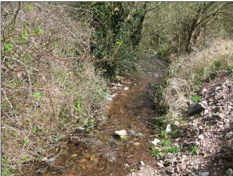
Plate 12: Cois na Gleann Stream along the northern end of pasture field before converging with Glashaboy, looking east