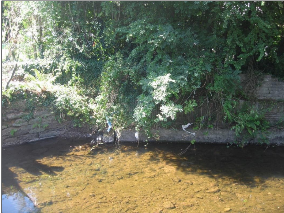
Plate 25: Western bank approaching Riverstown Bridge