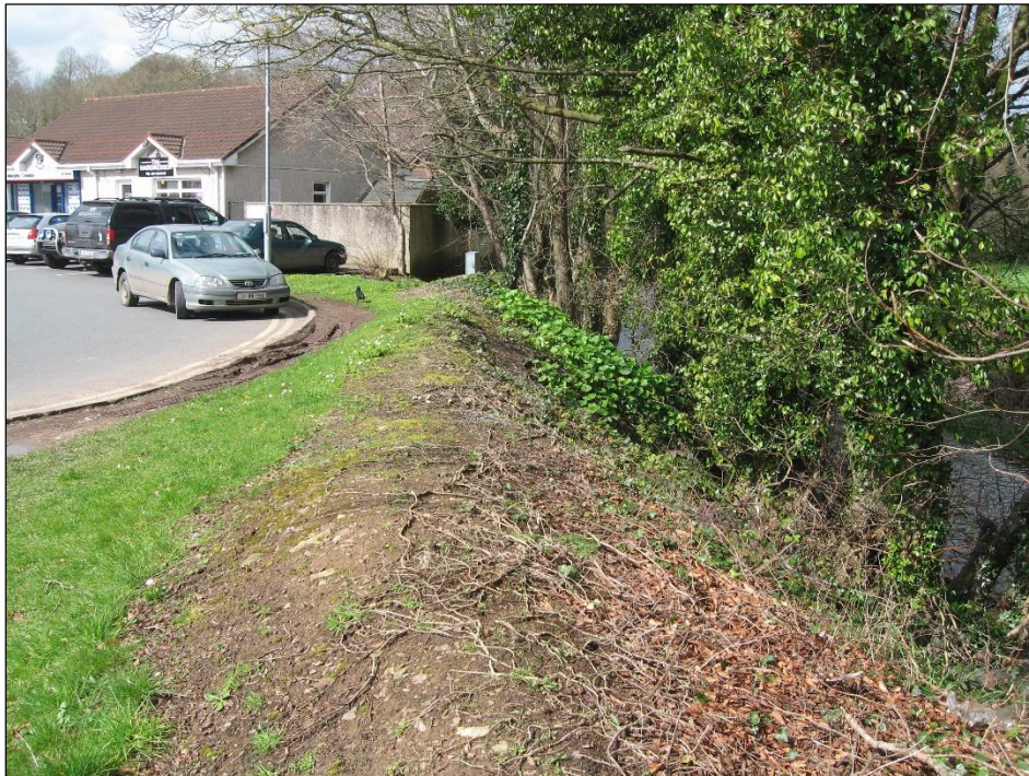
Plate 18: View of earthen bank in Glanmire Shopping Centre, looking north