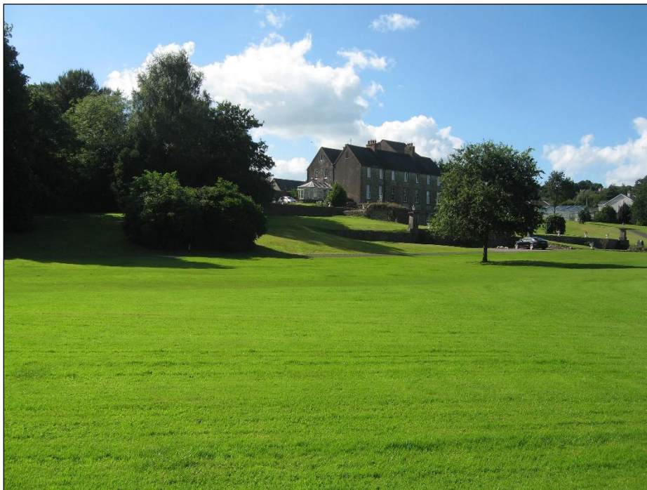
Plate 32: Lawn to the east of Riverstown House where embankment will be constructed and Riverstown House, looking northwest