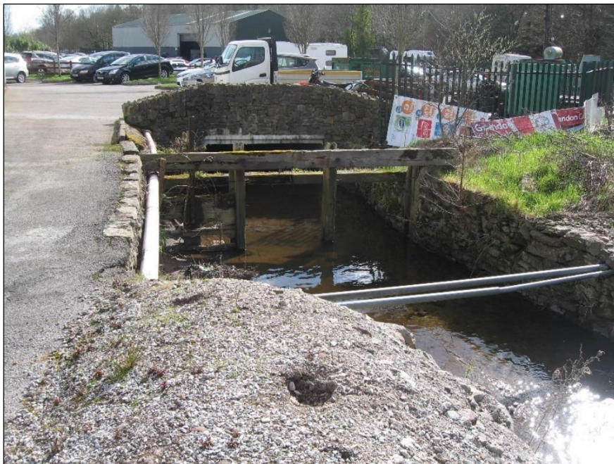
Plate 6: Mill race 3 opening in Grandon's Garage showing remains of sluice gate, before entering culvert, looking southeast