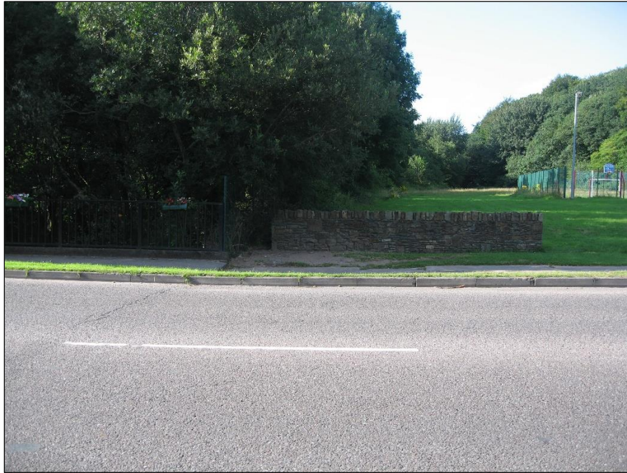
Plate 15: Hazelwood Avenue Bridge and adjoining green area where relief channel will be constructed, looking north