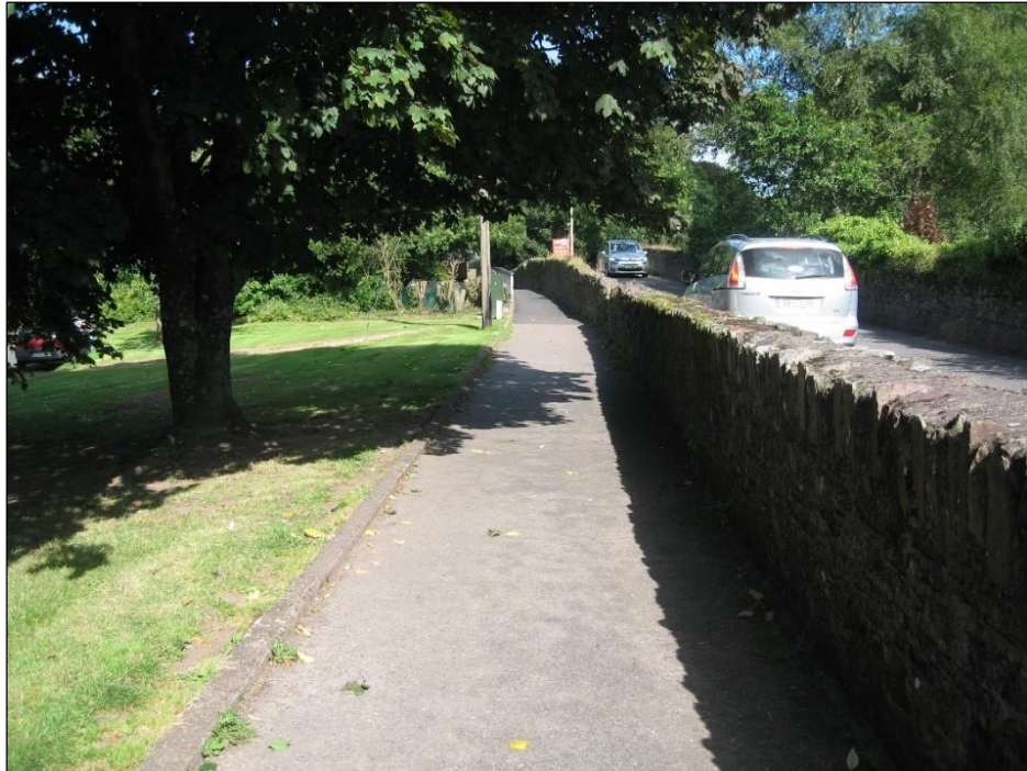
Plate 27: Path and green area to west of Riverstown Bridge