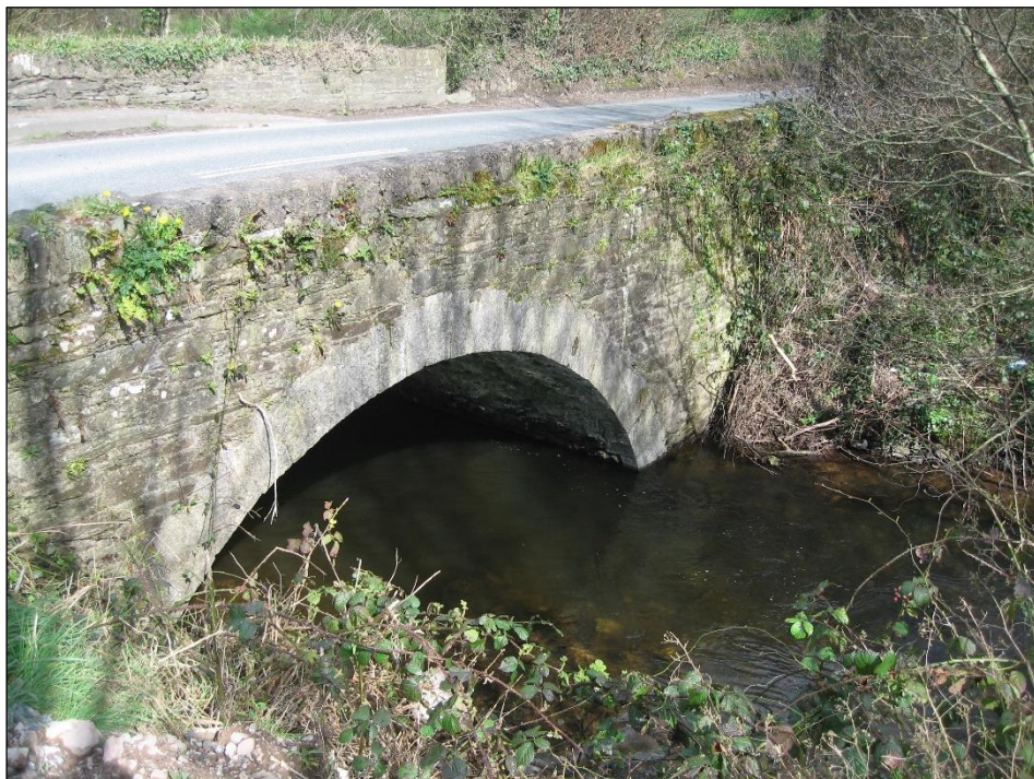
Plate 30: Southern elevation of unnamed single arch road bridge over Butlerstown River