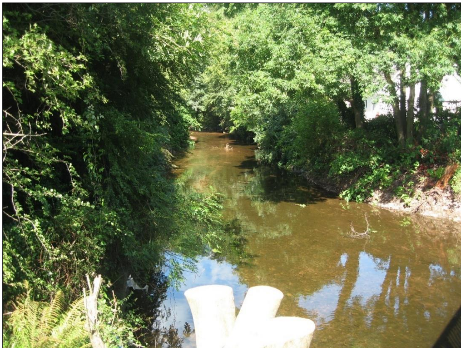
Plate 24: View upriver from Riverstown Bridge, looking north