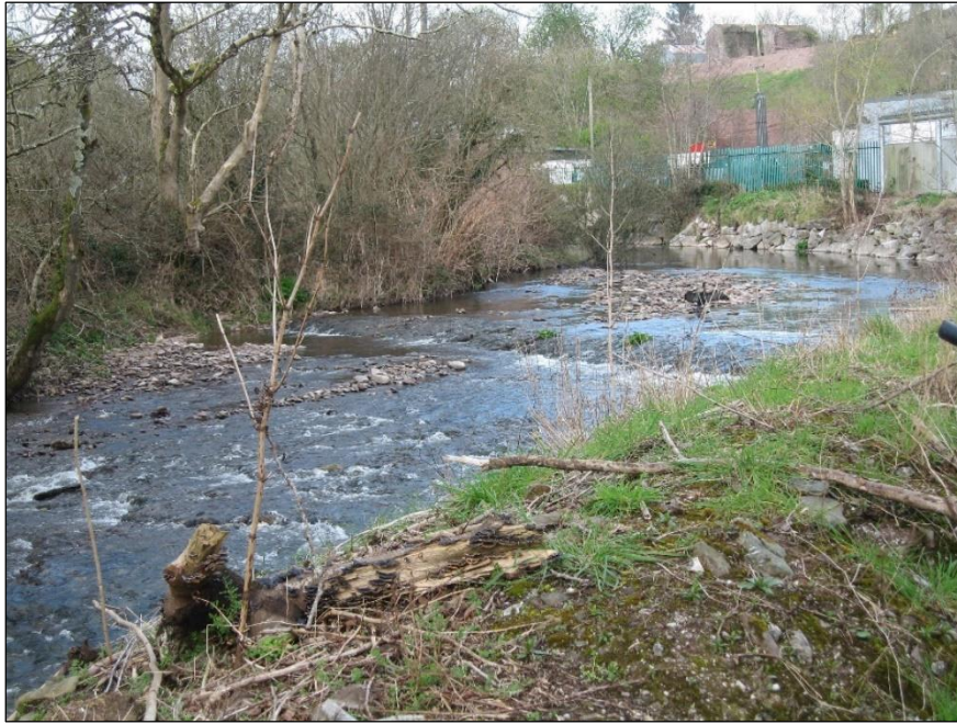
Plate 5: The Glashaboy River to the west of Grandon's Garage with rock armour visible upstream, looking north