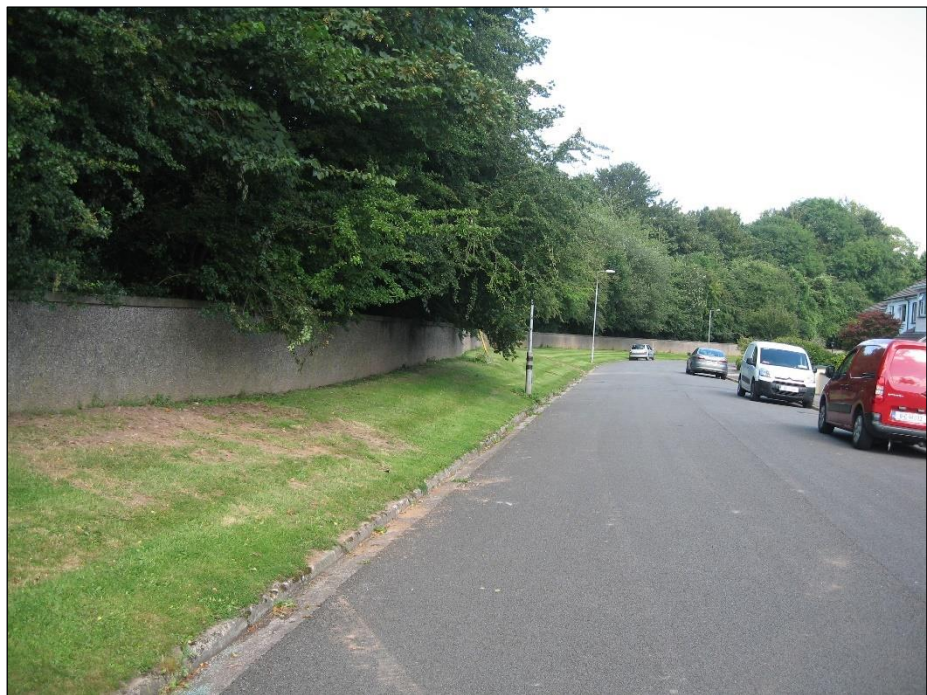
Plate 26: Wall parallel to river in Meadowbrook