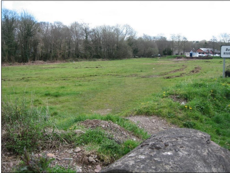
Plate 13: Field adjoining R639