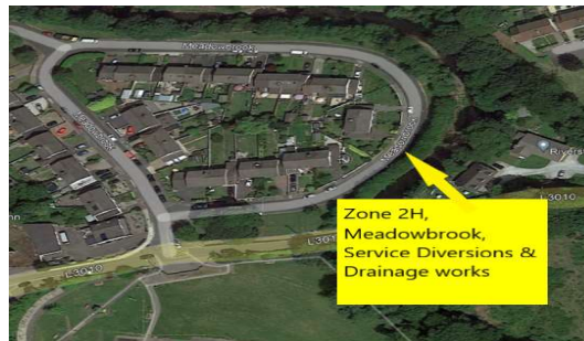
Fig.4 Zone 2H Meadowbrook Estate