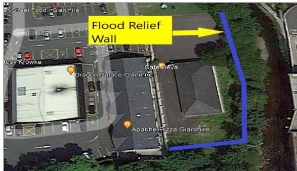
Fig.5 Zone 2F– O'Connor's Funeral Home, Hazelwood Shopping Centre