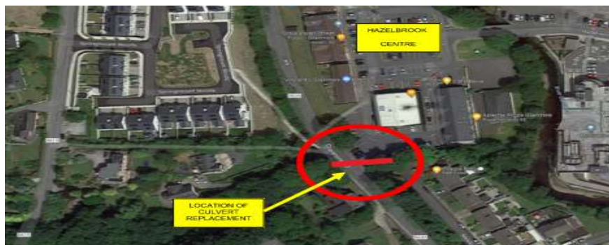
Fig.2-Zone 2G Springmount Culvert