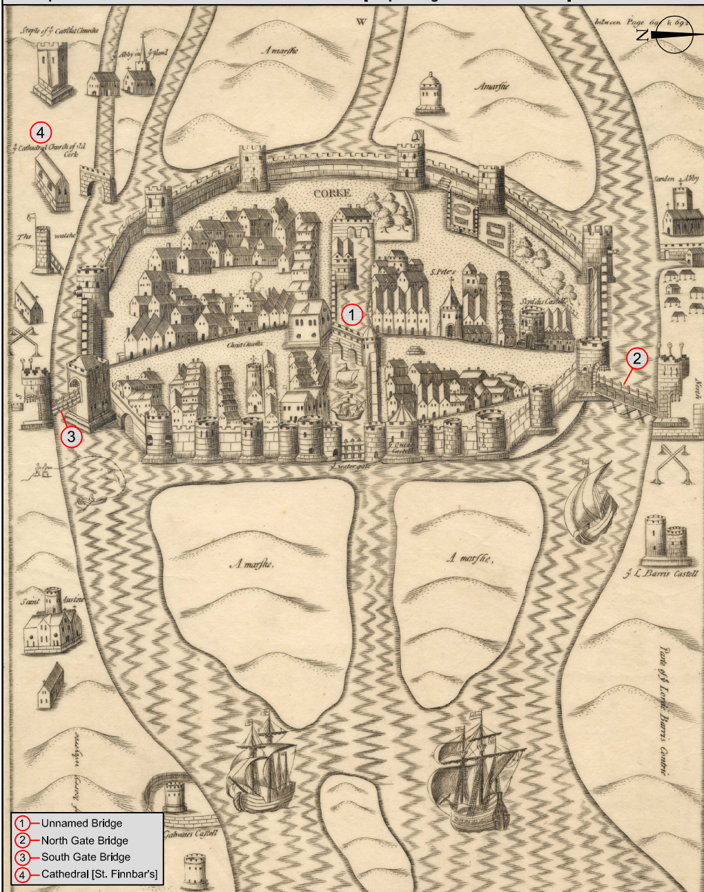
A- Map extracted from the Pacata Hibernia 1585-1600 [map thought to date from 1600].