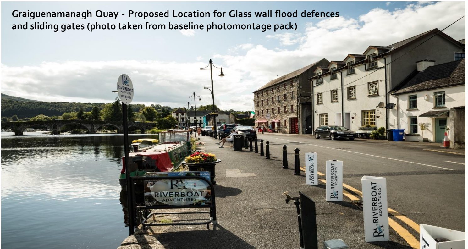
Graiguenamanagh Quay - Proposed Location for Glass wall flood defences and sliding gates (photo taken from baseline photomontage pack)

Flood Relief Works and Stormwater Drainage drawings have been compiled as part of the drainage design. A pump station is to be included which will be activated when the Barrow's water levels are high.